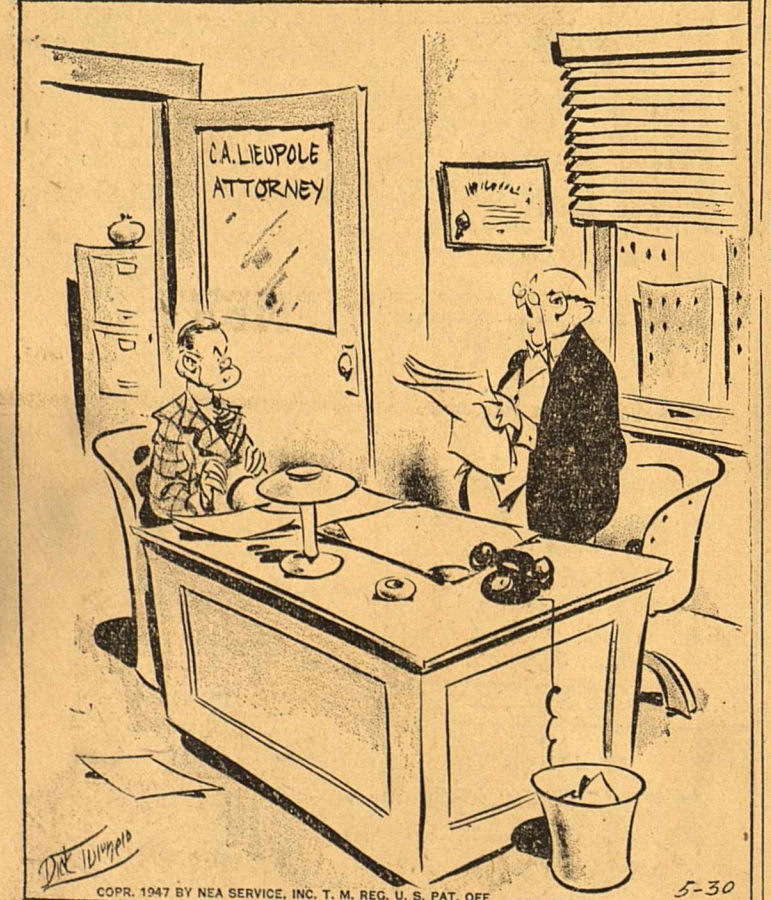
"Possibly you'd feel better about the whole thing if you'd think of your inheritance as the 'residue of the estate,' instead of the 'dirty end of the stick!'"