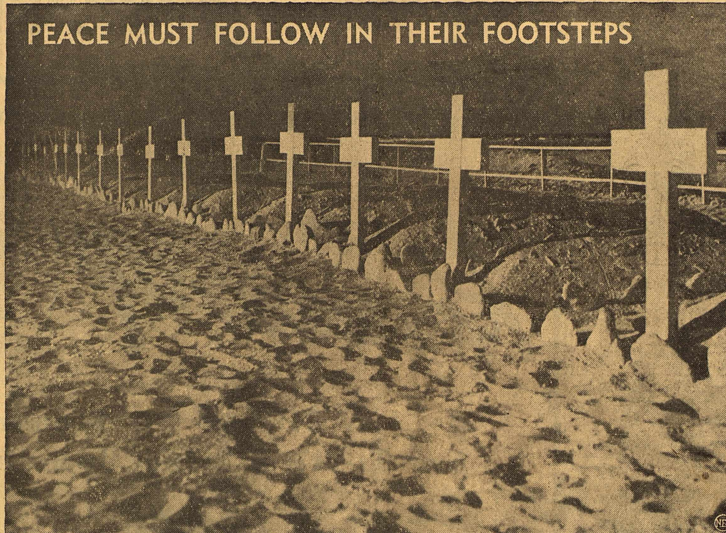
THESE are the graves of American servicemen on the beachhead where they fell in battle. Where? Well, it might be Normandy or Tarawa or Anzio or Iwo Jima or North Africa or some nameless islet that became a stepping stone to Tokyo. It doesn't matter. What does matter is that the men who died in those places and others gave their lives believing that their sacrifice would make the world a better place to live in. That means a world of peace. Not peace that just happens because of the lack of war—but peace that endures because the people of the world have outlawed war and banished it forever from the face of the earth.

GUATEMALA — (AP) — Authorities announced Friday the last of the 15 U. S. soldiers who parachuted from a burning Flying Fortress still were held by the fastnesses of a Nicaraguan jungle.