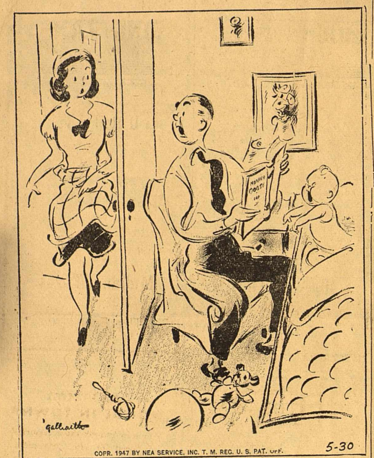
"Neither of us likes these nursery rhymes—shall we try him with some newspaper comics?"