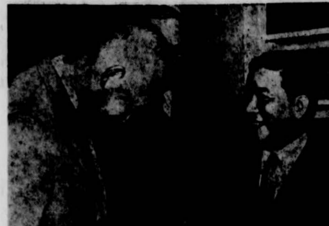
COMMON PURPOSE . . . Vietnam's Pres. Ngo Dinh Diem asks Pres. Eisenhower and State Sec. Dulles for continued U. S. aid to strengthen his country's defense against Reds.