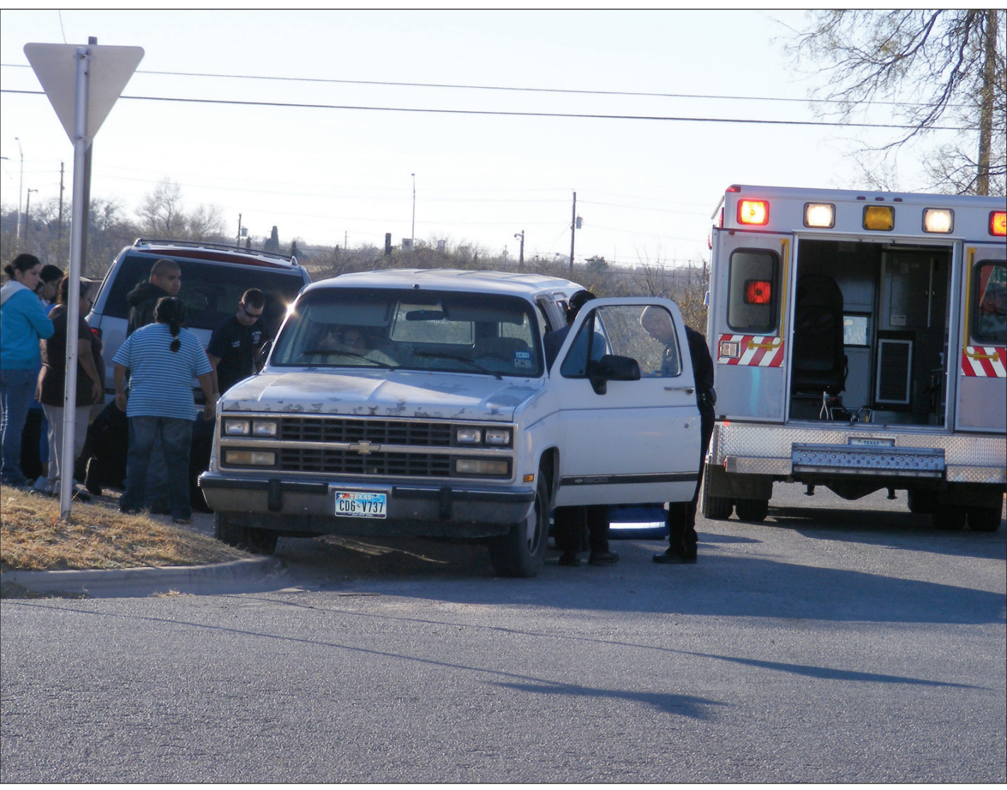
Police and emergency medical service personnel responded to the scene of a vehicle-pedestrian accident at the intersection of 12 th and Runnels streets late Wednesday afternoon. Injury reports were not available at press time.