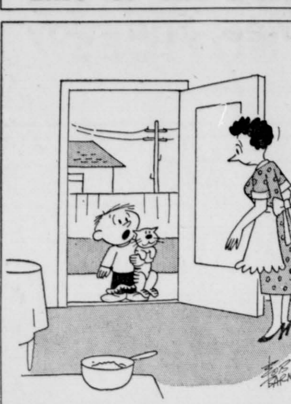
"Could we borrow a mouse, please?"