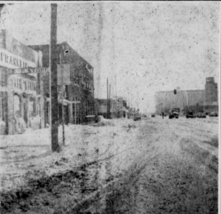
WINTER IN SPRING —Scenes like this one were common over the weekend as county residents stayed at home and watched one of the most devastating blizzards on record roar past their windows. The north part of Dimmitt was hardest hit as homes in that portion broke the main force of the heavily drifting snow. Drifts as high as houses were common in that section of town while in the southern portion the piles of snow were more moderate in size. News photographers took numerous other pictures over the town Sunday morning but poor lighting conditions prohibited photos suitable for mechanical reproduction.

Two candidates have announced for the two positions open on the Nazareth board. They are Jim Schwallier and incumbent R. E. Stephens. Seeking to fill the posts being