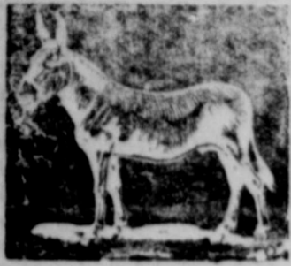
NOTICE TO STOCKMEN

FOR SALE—Good second hand refrigerator, 50 pound capacity. At Plainsman office Phone 187. 20