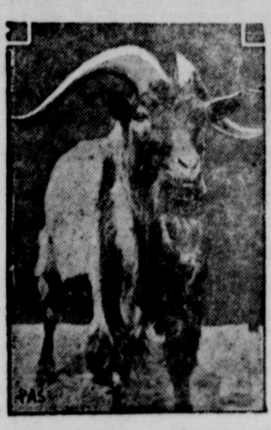
THE GOAT COLUMN