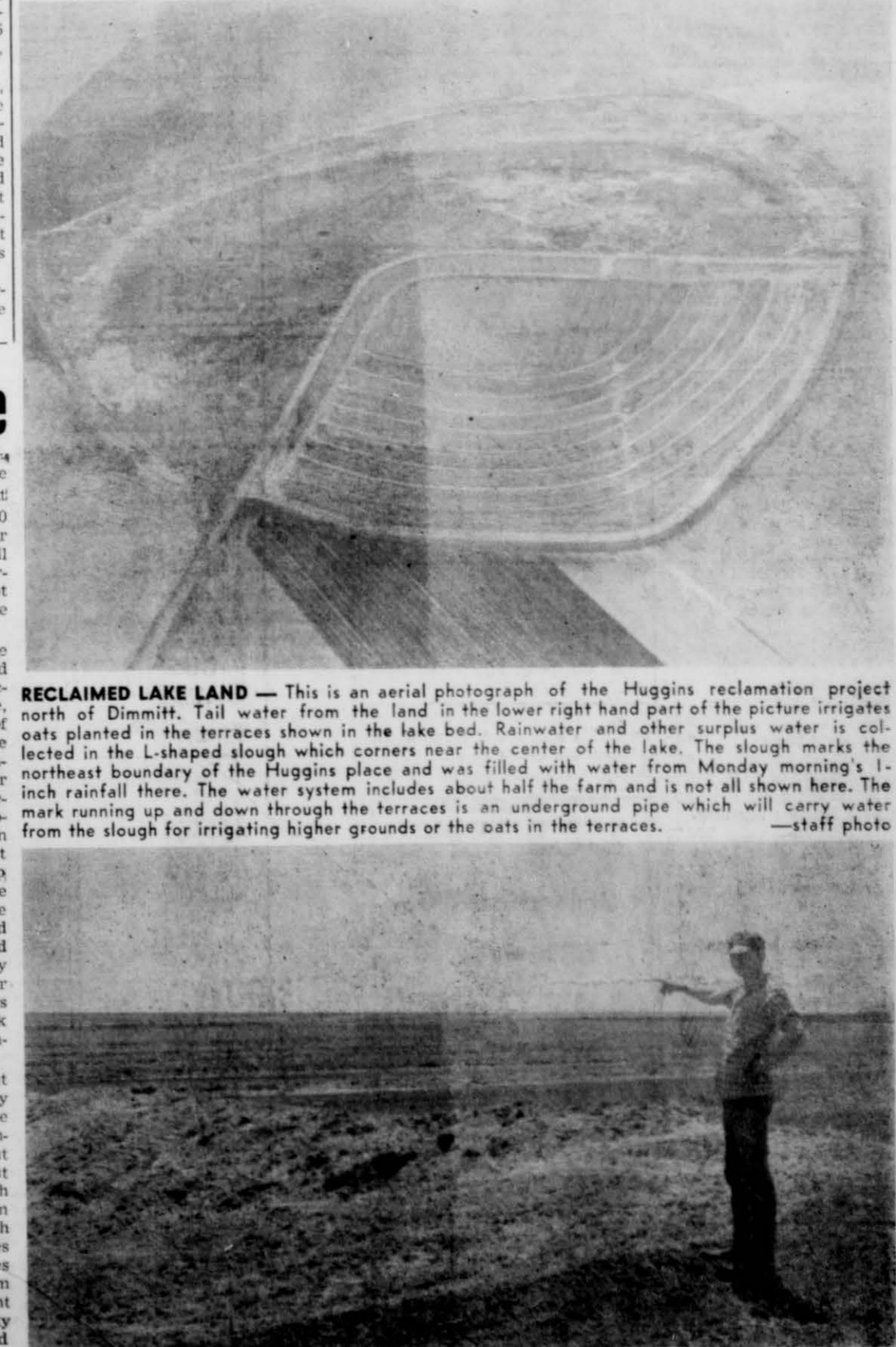
RECLAIMED LAKE LAND — This is an aerial photograph of the Huggins reclamation project north of Dimmitt. Tail water from the land in the lower right hand part of the picture irrigates oats planted in the terraces shown in the lake bed. Rainwater and other surplus water is collected in the L-shaped slough which corners near the center of the lake. The slough marks the northeast boundary of the Huggins place and was filled with water from Monday morning's 1-inch rainfall there. The water system includes about half the farm and is not all shown here. The mark running up and down through the terraces is an underground pipe which will carry water from the slough for irrigating higher grounds or the oats in the terraces.