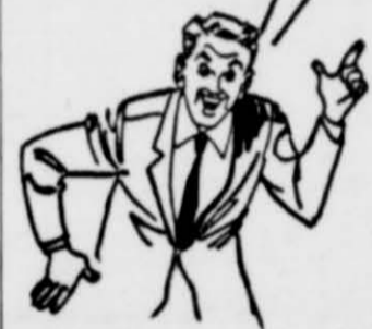
The Castro County News

YOU'LL FIND IT EASY TO DO BUSINESS WITH BECAUSE WE WANT TO HELP YOU GET YOUR JOB DONE. NO MATTER WHAT IT IS - SELLING, RENTING OR BUYING. WHY NOT GIVE US A CALL?