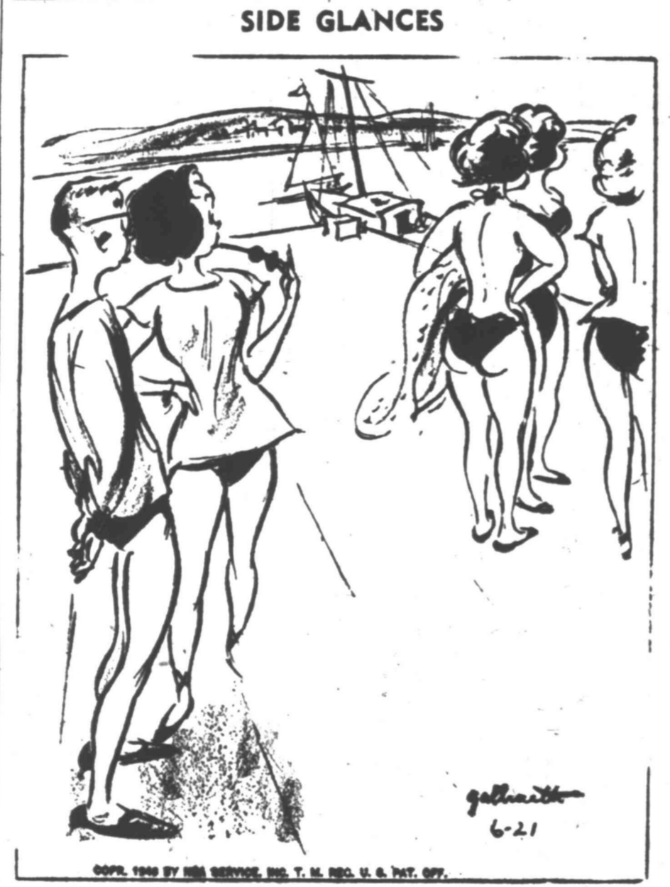
"I'm writing a novel this summer, and I picked this as the ideal artistic environment!"