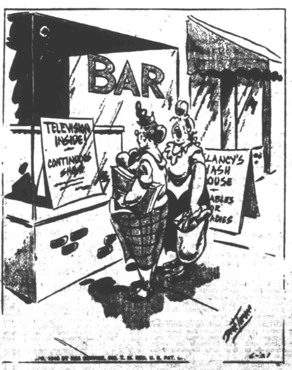
"I'm not interested now, but when they get television to the place where it looks INTO saloons, I'll be a customer!"