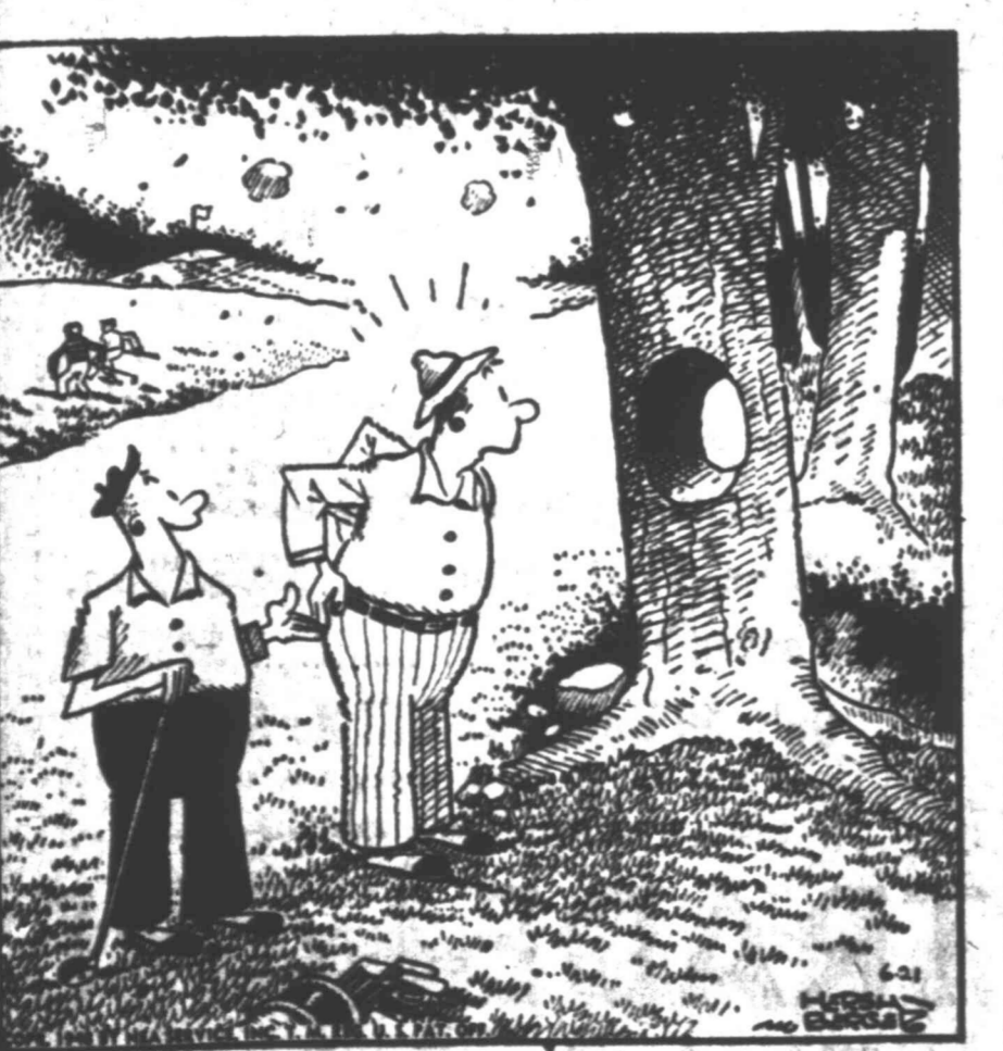
"I kept hitting it so consistently I had a hole cut through it!"