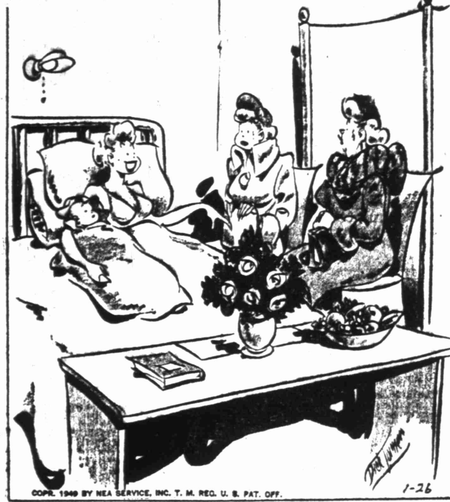
"It was nothing compared to the ordeal we went through adopting little Waldo—no references, no embarrassing questions, no sitting around in agencies..."