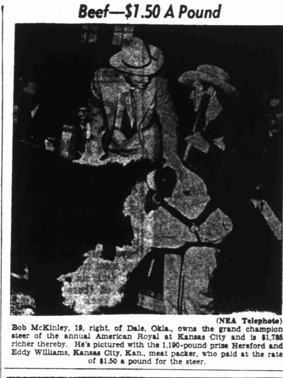
Beef—$1.50 A Pound