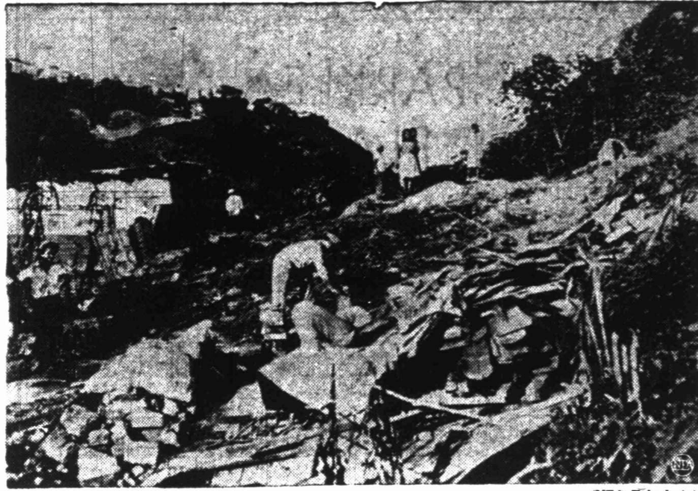
The flood-stricken area of Guatemala City where a reported 4,000 were killed and 100,000 made homeless is searched by military personnel for missing bodies. Homes were demolished by the onrushing waters following torrential rains.