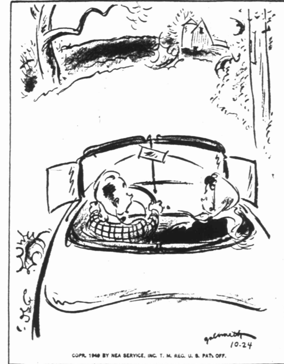
"It's kind of late for us to elope—we couldn't make it back home for dinner!"