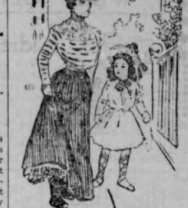
WEARING SANDALS. that or girls work it way to the sole of the sandal, and that hurts the child's feet.

The women of London have taken to the Grecian and Roman sandals this year and at the watering places the most fashionable dames and misses are wearing them. "It is children who wear them principally," a maker of these sandals acknowledged, "children and young people. Women have them mostly for indoor wear, but the children's sandals are for general use, and it is astonishing how frantically they trade has grown during the last few years. Personally I have an idea this sandal-wearing is more of a passing fancy than a permanent institution. You see, this climate is so changeable it might rain at any moment, and the child's feet get very wet, and if in the summer it is not wet it is usually extremely dusty, and the dust gets through the stockings to the feet and is very uncomfortable, especially as