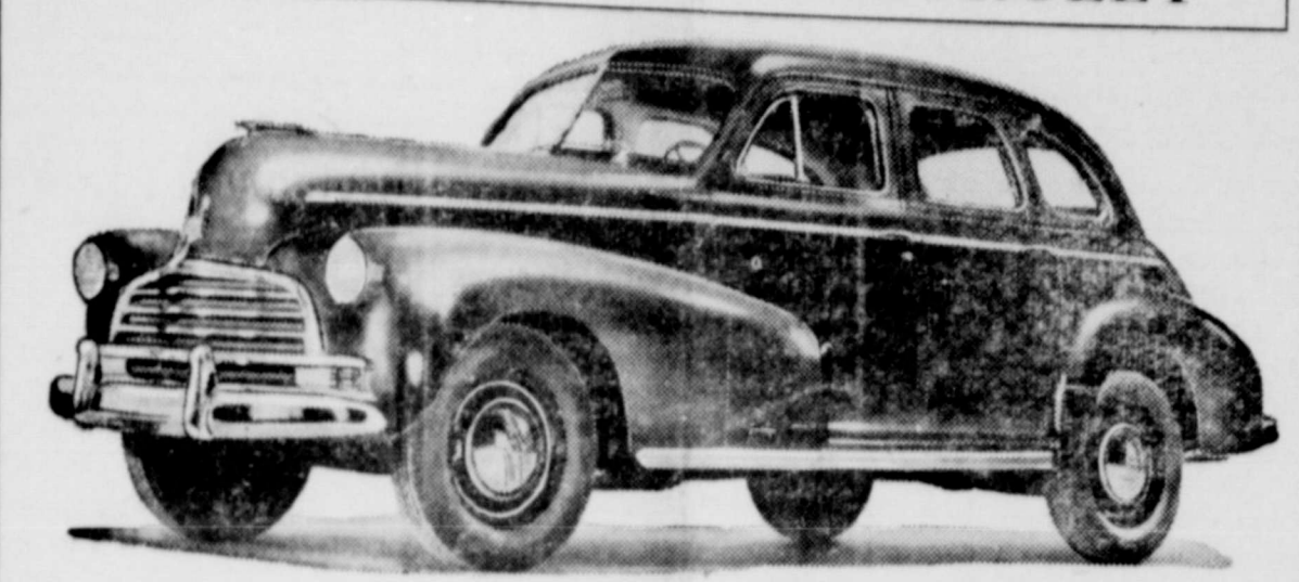
The Stylemaster Sport Sedan