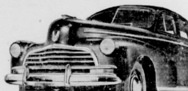
Front-End Styling Accentuates Massive Low Lines