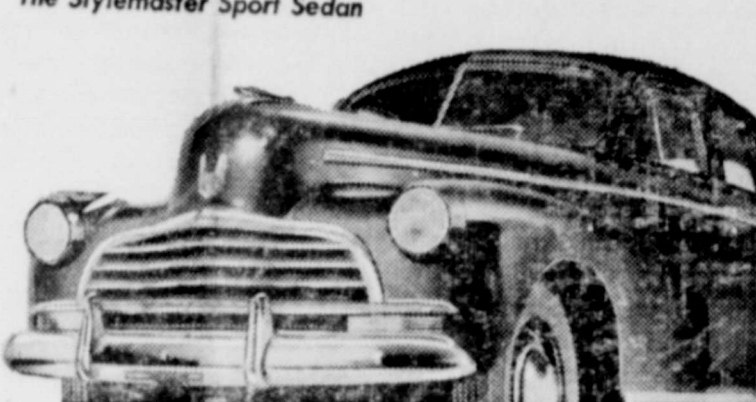
Front-End Styling Accentuates Massive Low Lines