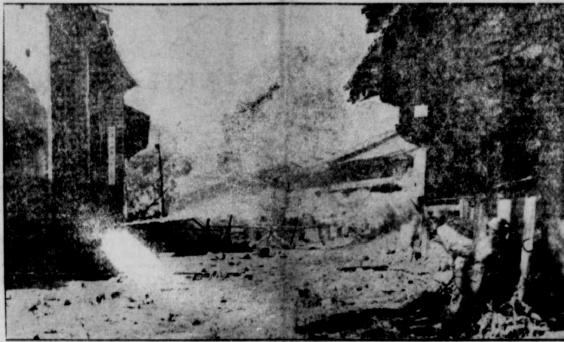
A Chinese soldier attacks with a flamethrower in the fierce fight for Tengchung, first Chinese city east of Burma to be liberated. Chinese troops, supported by the U. S. 10th and 14th Air Forces, fought five weeks to oust 2000 entrenched Japs. Tengchung, the ancient jade city, is a key to junction of the Burma and Ledo Roads.