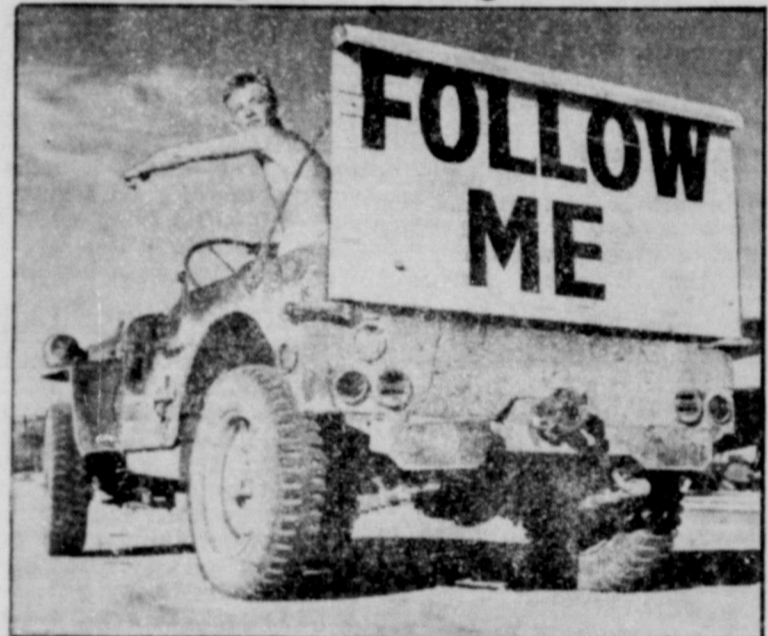
Big bombers based on Eniwetok of the Marshall Islands, now a U. S. base, follow the lead of this jeep when looking for parking places after landing on the supply-jammed atoll.