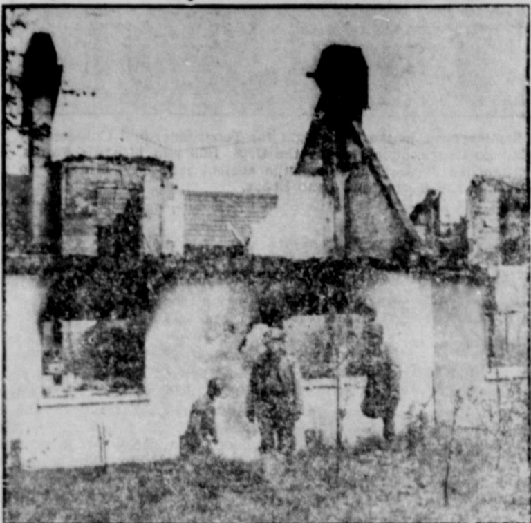
American troops inspect burned ruins in a village just inside the Siegfried Line near Aachen. The village, which happened to be in the path of advancing Allies, is now in somewhat the same condition other villages—which happened to be in the path of the German blitzkrieg of yore—are in. Kismet.