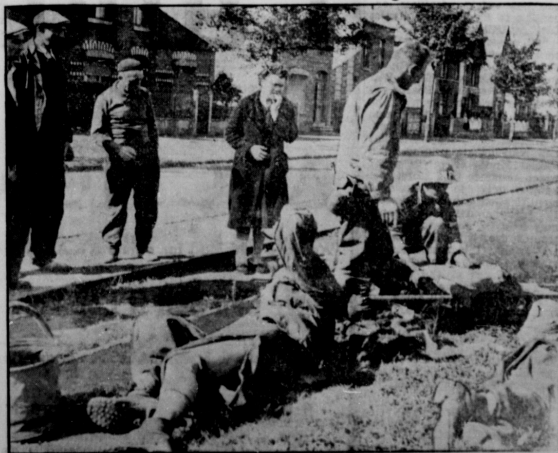
Tensely biting her nails, a Belgian woman and neighbors watch American Medical Corpsmen dress wounds of German soldiers who got in the way of Allied machine gun bullets near Mons.