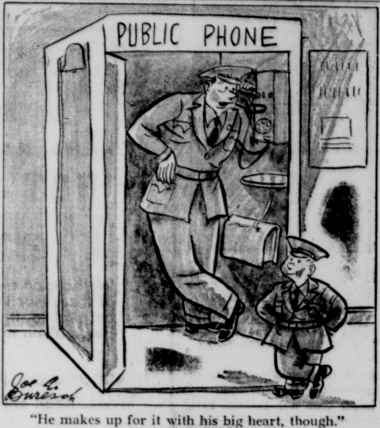
"He makes up for it with his big heart, though."