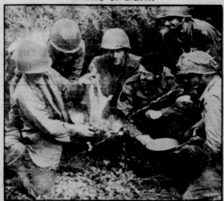
Only 300 yards from enemy lines on the Westwall front, but when a chicken dinner's in sight these G. I.'s just can't be bothered.