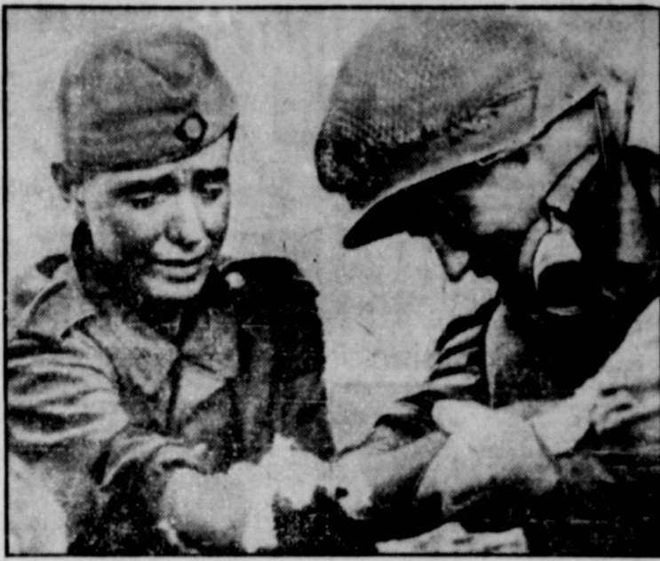
This youthful Nazi hardly looks the hero as an American soldier administers first aid to his arm wound while awaiting arrival of a medic.