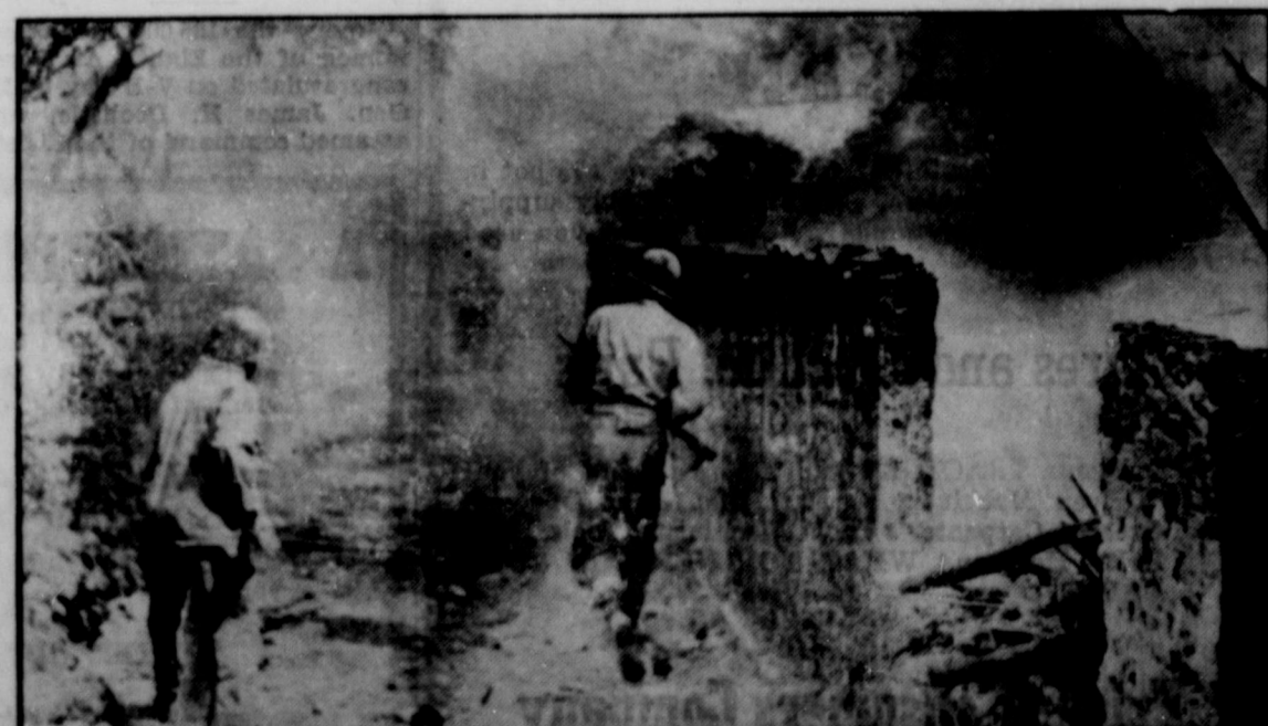
American Marines advance into Naha, capital of Okinawa, through smoke and flames of a building set afire to dislodge Jap snipers. This is the site of some of the bloodiest fighting on the island. The 6th Marine Division is fighting in the Naha area.