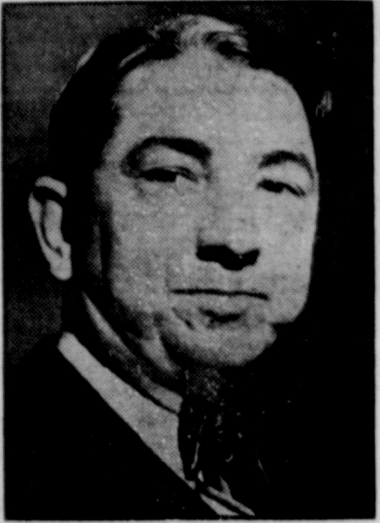
Tom C. Clark of Dallas, Tex., has been named Attorney General by President Truman, replacing Francis Biddle. Clark had been Assistant Attorney General.