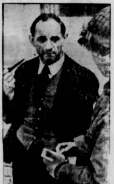
Pastor Martin Niemoeller, who became a symbol of resistance to Hitler's anti-church policies because of his forthright stand against Nazism from his Berlin pulpit, talks with an American correspondent in Italy after his liberation from a concentration camp in the Alps.