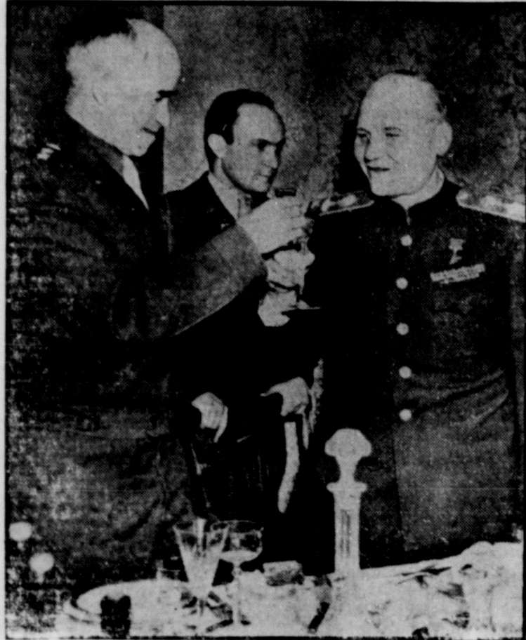
Gen. Omar Bradley, left, and Russian Marshal Ivan Konev drink toast to victory at banquet in a German country home near Berlin.

posts to the front. In the words of the citation: "His devotion to duty and his tireless energy in accomplishing his many tasks are in accordance with the highest traditions of the United States."