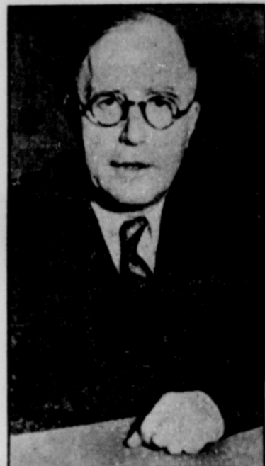
Lewis B. Schwellenbach of Spokane, Wash., Federal judge and former U. S. Senator, has been named Secretary of Labor, succeeding Frances Perkins.