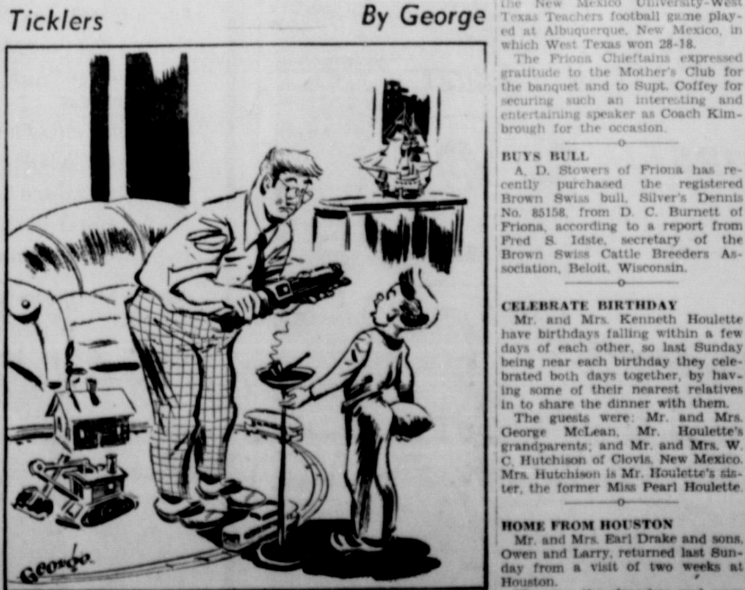
Why can't I smoke your pipe, Pop? You're playing with my train."