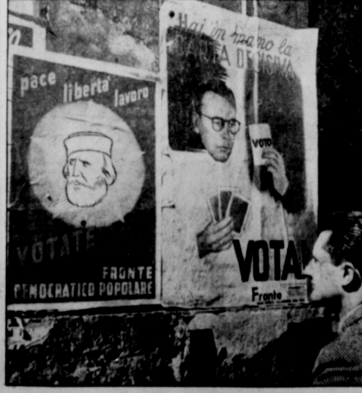
With 22 parties screaming for votes, poster space is at a premium in Rome, Italy. Here a voter looks at the appeal of the Communist-Socialist bloc (left). The other poster simply urges him to vote. The Communist poster carries the head of the famed Italian patriot, Garibaldi, superimposed on the Red Star.