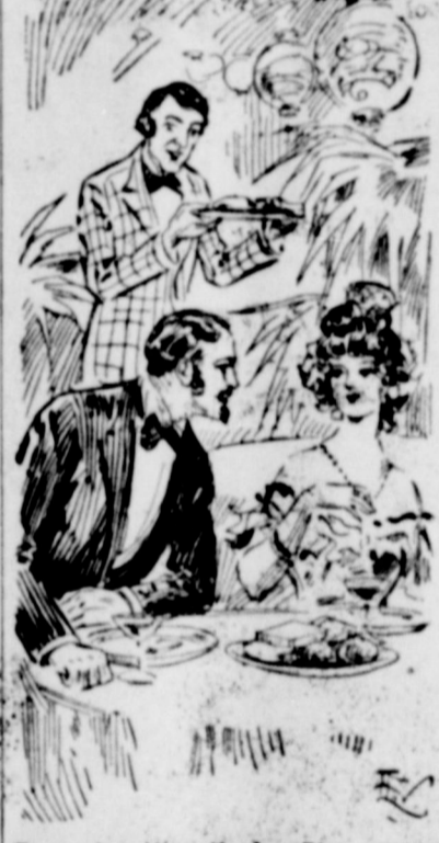
Possessing Himself of a Plate and a Goodly Portion of Chicken, Shottle Returned and Brazenly Seated Himself Near Them.

At ten minutes past one o'clock, Virgil Drace was standing in the shadow of a tree near the street, his hand decided upon, cursing himself for a half-