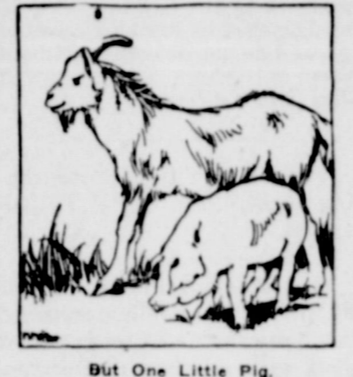
But One Little Pig.

The children hadn't been told an animal story for some time, and Daddy thought it was high time to tell one. "How about a story of some little baby pigs?" asked Nancy. "We would love to hear a story about some pigs," said Nancy. "We haven't heard a story about pigs for ever and ever so long. Is this to be about our beloved family of pigs, Porky Pig, Brother Bacon and the others?" "No," said Daddy, "this is to be of another family of pigs." "That's what I thought," said Nick. "Do tell us about them, Daddy." "Well, the pig family that I am going to tell you about," began Daddy, "were having the best time you can possibly imagine, as they loved having day after day of warmth and sunshine. "The part of the country where they lived always had warm weather. "So they were perfectly happy. They would lie for hours in the most comfortable place they could find and never budge until they felt hungry. "But one little pig became quite intimate with a goat that resided in a field nearby. "The goat's family were not so lazy as the little pig's family were, and at first the goat's family didn't want