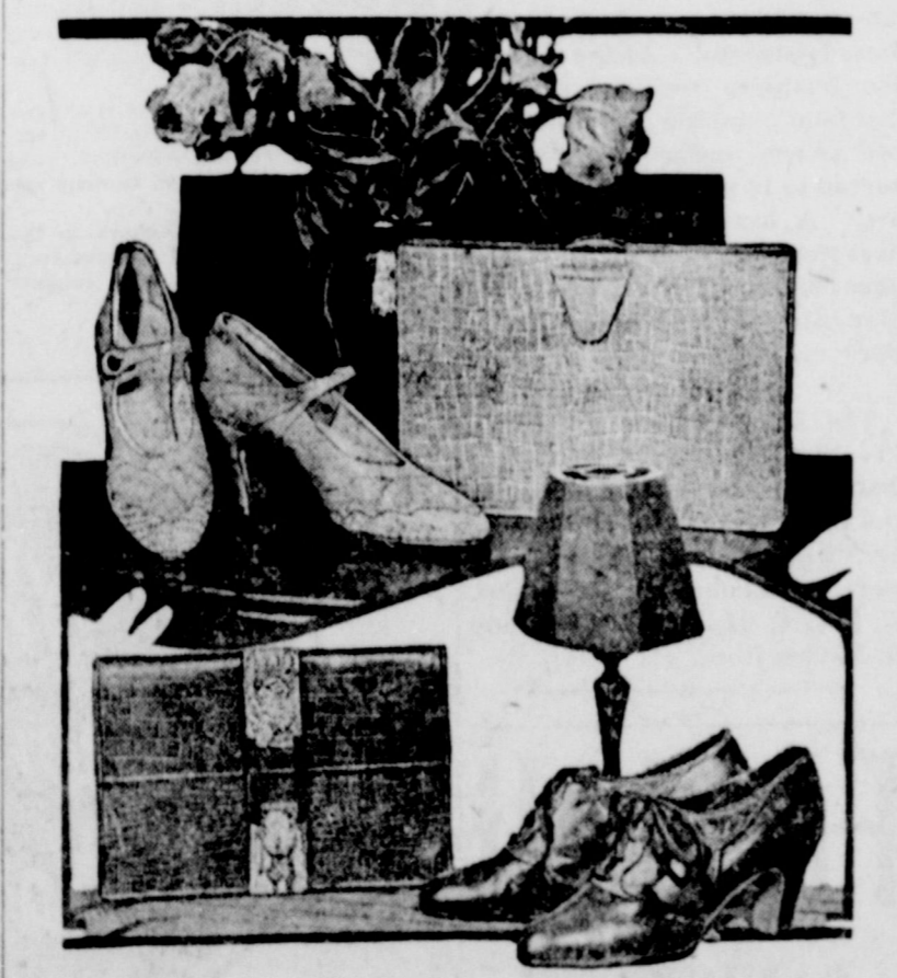
DISPLAYING REAL ARTISTRY

bine artful patterning and multi-coloring with fascinating results. So supple is the modernized velvet, it yields to manipulation as gracefully as does the daintiest of chiffon. Which is as it must be since a vast amount of shirring and intricate working of the fabric itself play a prominent part in this season's styling. Regarded as a latest expression of the French mode is the exquisite Philippe et Gaston velvet evening wrap in this picture. A study in detail of this magnificent model is illuminating as to Fashion's trend. Firstly, it is in deep cherry coloring, thus emphasizing the predilection for red tones. Secondly, it has a shirred yoke, which is doubly significant in view of the fact that yoke-styling characterizes both dress and wrap of latest creation, and as to shirring it is an item of outstanding importance. Thirdly, this modish wrap is back-bloused, which is at present considered essential to good style. Fourthly, it is lavishly embellished with fur in accordance with fashion's dictate for this fall and winter. Finally, the voluminous sleeve proclaims