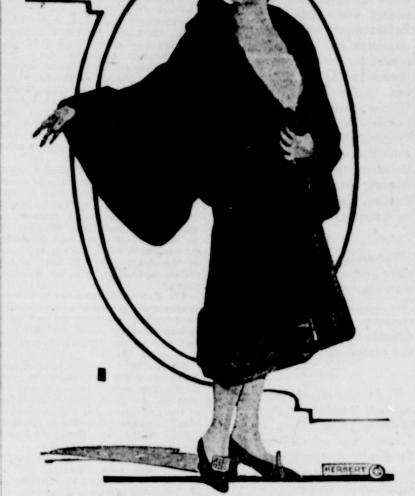
AN EXQUISITE EVENING WRAP

Velvet is a chosen medium for the fashioning of milady's evening wrap. This fair for velvet accents the fabric in both solid coloring and also in striking velvet facounes which com-