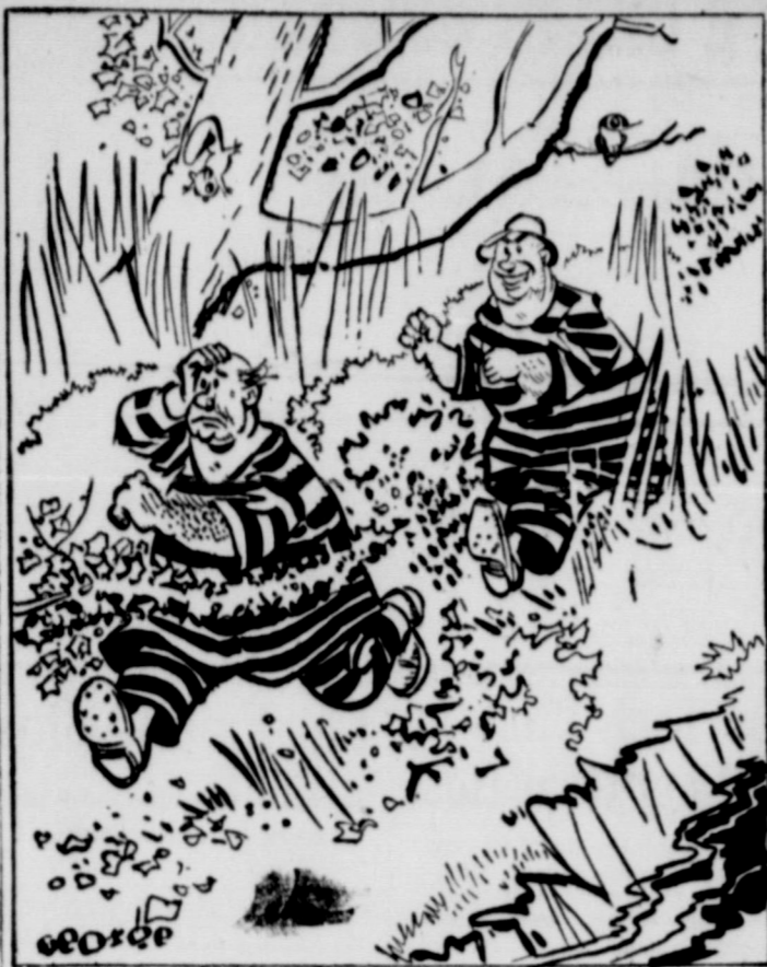
"I hope they send the bloodhounds! My kid always wanted a dog."