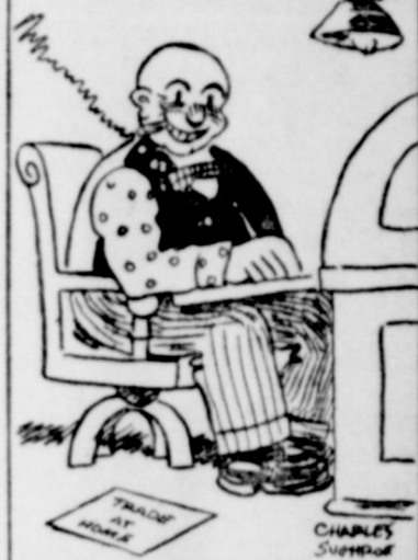
TURN ME OVER

WE MAGNETS THAT DRAW TRADE AND HOME SEEKERS ARE ATTRACTIVE BUSINESS PLACES, WELL-KEPT GYRETS, COZY HOMES, LIVE LODGES, HOSPITABLE CHURCHES, GOOD SCHOOLS, FRIENDLY PEOPLE! WE HAVE ALL THESE, BECAUSE WE'RE ALL DOING OUR BIT!