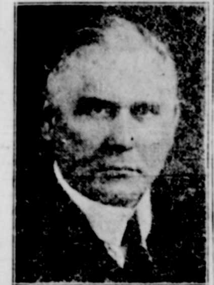
DR. GEORGE W. TRUETT of Dallas President Southern Baptist Convention