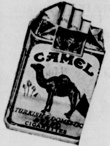
© 1929. E. J. Reardon Tobacco Company, Winston-Salem, N. C.

Only a superior cigarette could have won and held world leadership for all these years as Camel has done.