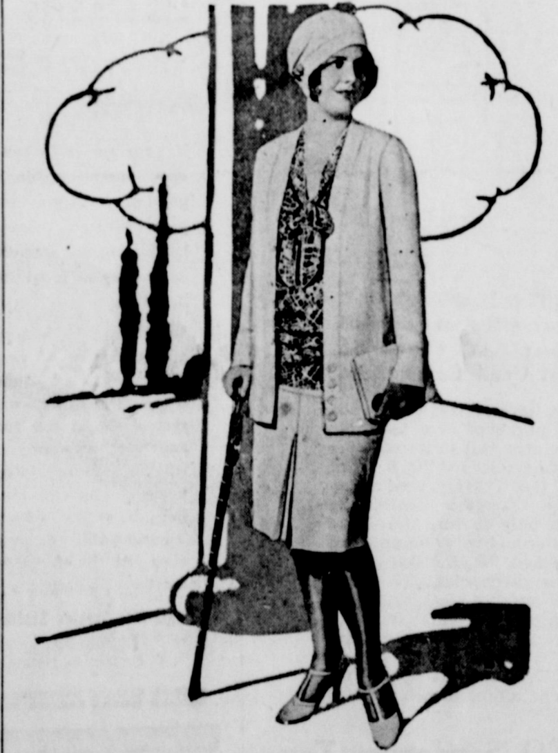
A Fetching Sports Ensemble.

White shoes, with stockings to match the predominating color in the blouse, add a fetching effect. And