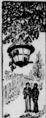
"I Built It Myself."

One day a man was walking along by the bird house he had built and a friend was with him.