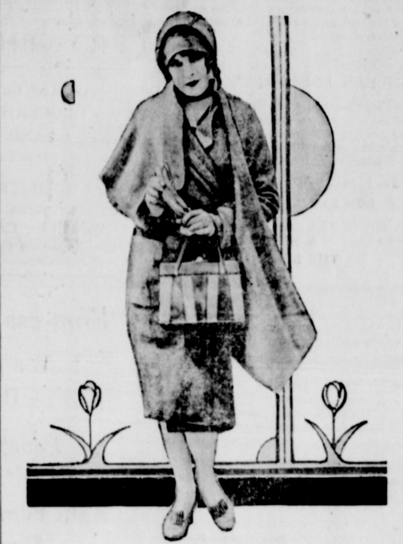
For the Vacation.

Materials for sports ensembles include a generous number this season—