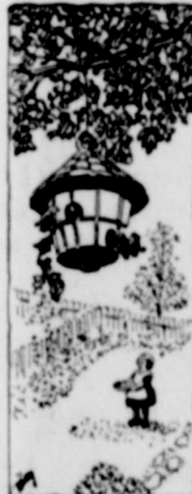
"We'll Fool Them."

Just then the little girl of the big house came out and threw some bread-crumbs over the ground.