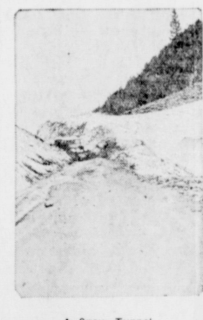
A Snow Tunnel.

And it came into my mind there and then—I who had never wanted to marry before—that this was what true marriage might mean. Something that could hold a man in spite of himself, in spite of a world of Jinny Treachers.