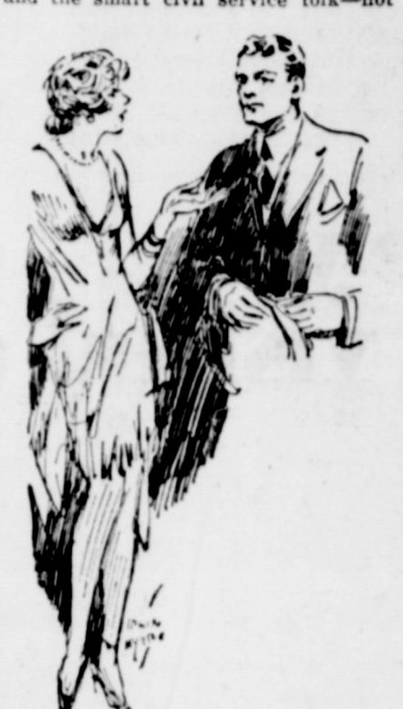
Gin-Sling, However, Had No Mind to Be Neglected.

one might almost call it biology) of the actress troupe that had fairly dynamited the peace of the ship.