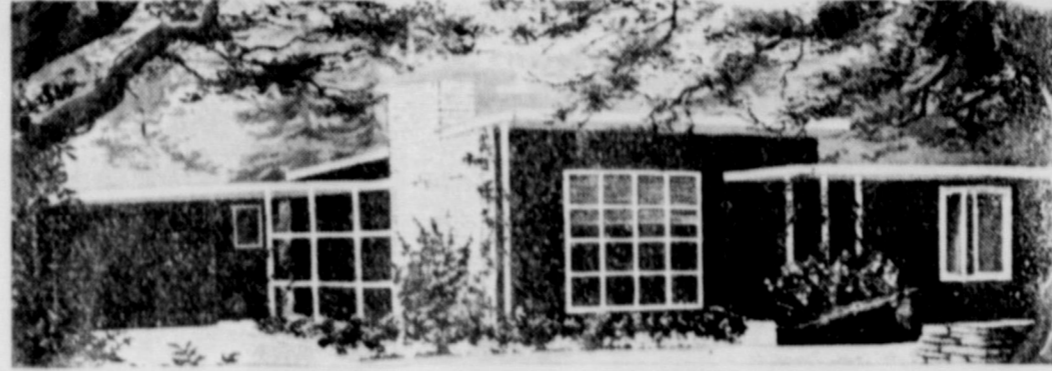
SOUND SIMPLICITY at rock bottom cost is the keynote of this new model home recently opened by the Montauk Beach Company, Inc., on Long Island N. Y. Designed after the suggestions of Douglas Tuomey, building consultant for Good Housekeeping magazine, the architect kept expenses down by: (1) Elimination of basement; (2) Simple frame and roof; (3) Drs. Wall construction; (4) Simplified windows and trim; (5) Use of closets for partitions. Although the house embodies the latest principles and advancements in moderate priced design and construction, it's so simple to build that the toolwise amateur can do much of the work. The Montauk House lends itself to any seashore terrain and can be used for a summer or year round home. It is featured in the June issue of the magazine.