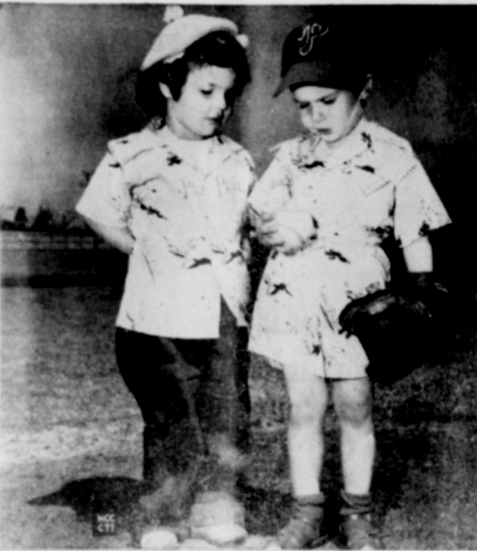
A feminine fan looks on a critically while this all-star pitcher examines the ball critically before his wind up. Both the pitcher and his lady-friend are boosters of the Philadelphia Phillies, for they are wearing cotton shirts imported with the team's insignia. For youthful supporters of other major league teams, the Phillies' logos are printed on Pacific cotton, the National Cotton Council requests.

FOR Aerial Spraying That Gets The Job Done Contact Benger Air Park