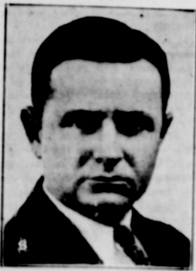
JAMES V. ALLRED