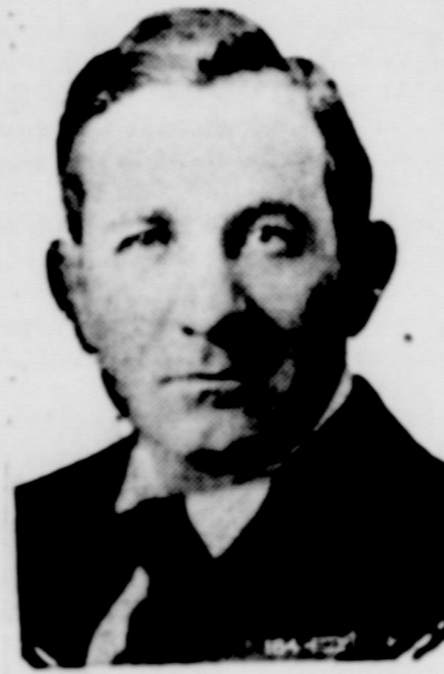
SEN. TOM CONNALLY