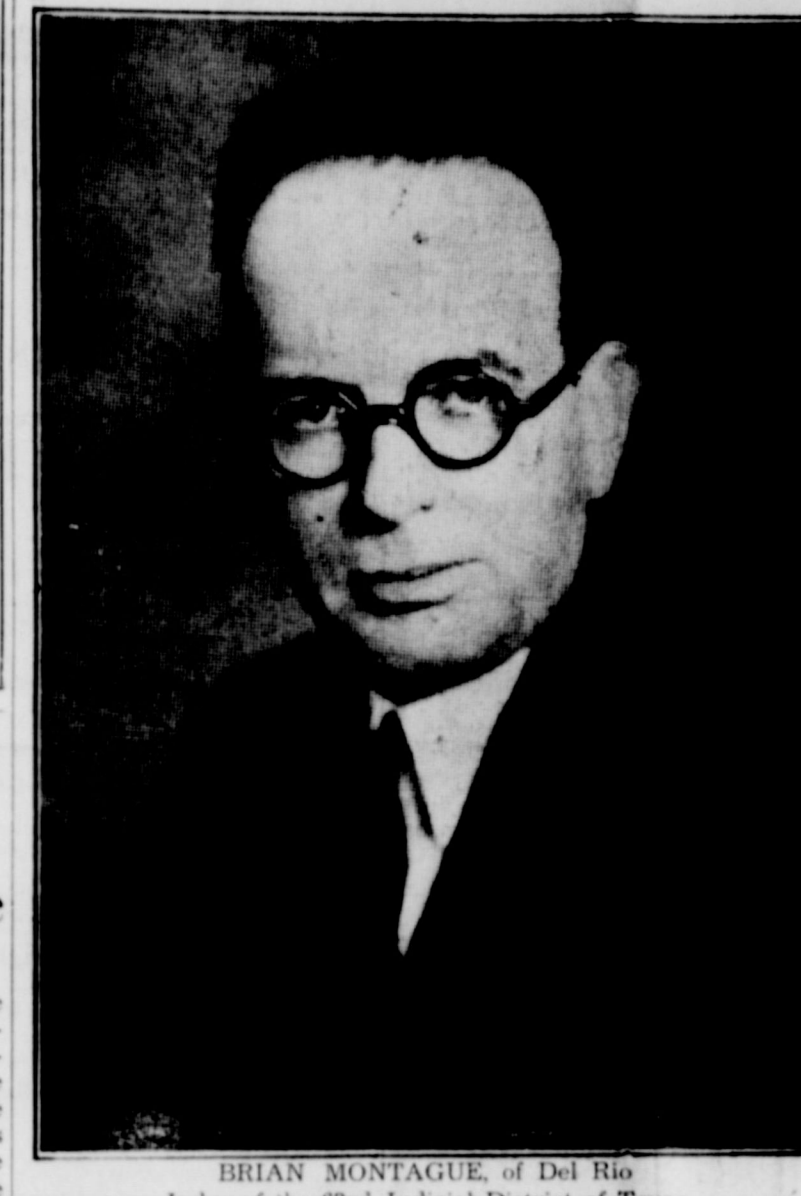
Judge of the 63rd Judicial District of Texas