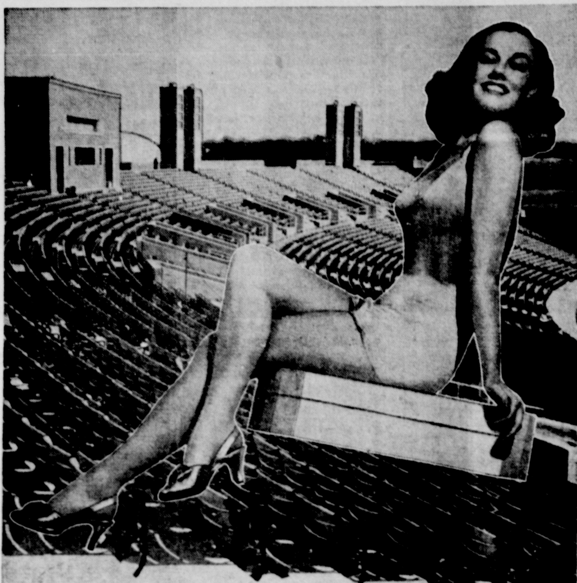
NEW YORK—Ballet on land and water will thrill visitors to the New York World's Fair opening on April 30. In the Marine Amphitheatre which seats 10,000 persons, Eleanor Holm (inset), Olympic swimming and stage star, will head a cast of 100 girls in Billy Rose's Aquacade ballet. Two hundred others will dance on the stage. The show's production will cost $1,000,000, according to Grover A. Whalen, President of the Fair.

on the dog and albumenoids for a case of eggs. The balance is water, unless he happens to be a politician, and then it is wind.