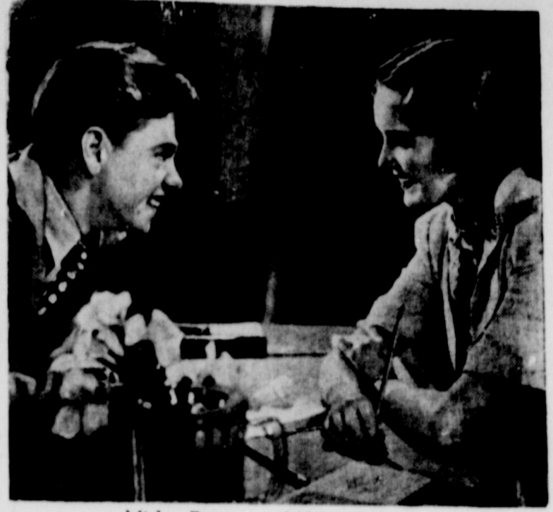
Mickey Rooney and Helen Gilbert in "Andy Hardy Gets Spring Fever"