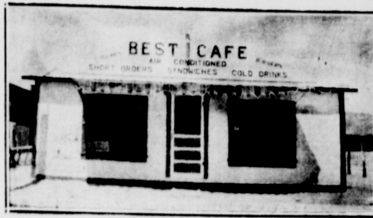
NEW CAFE IS OPENED—