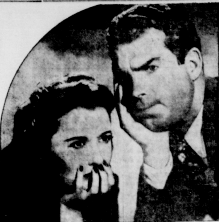
BARBARA STANWYCK AND FRED MACMURRAY—appear on the Princess screen Wednesday and Thursday in "Remember the Night."

Texas Mohair Weekly—At a meeting of the Rocksprings school board, held last Monday