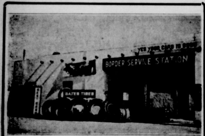
TIRE SALES FOR LAST WEEK IN NOVEMBER—