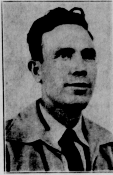
CHANGE IN MANAGERS—

The meeting was enjoyed by all present and plans were made for the semi-annual cake and pie sale to be held in the near future. Date of sale to be announced later.