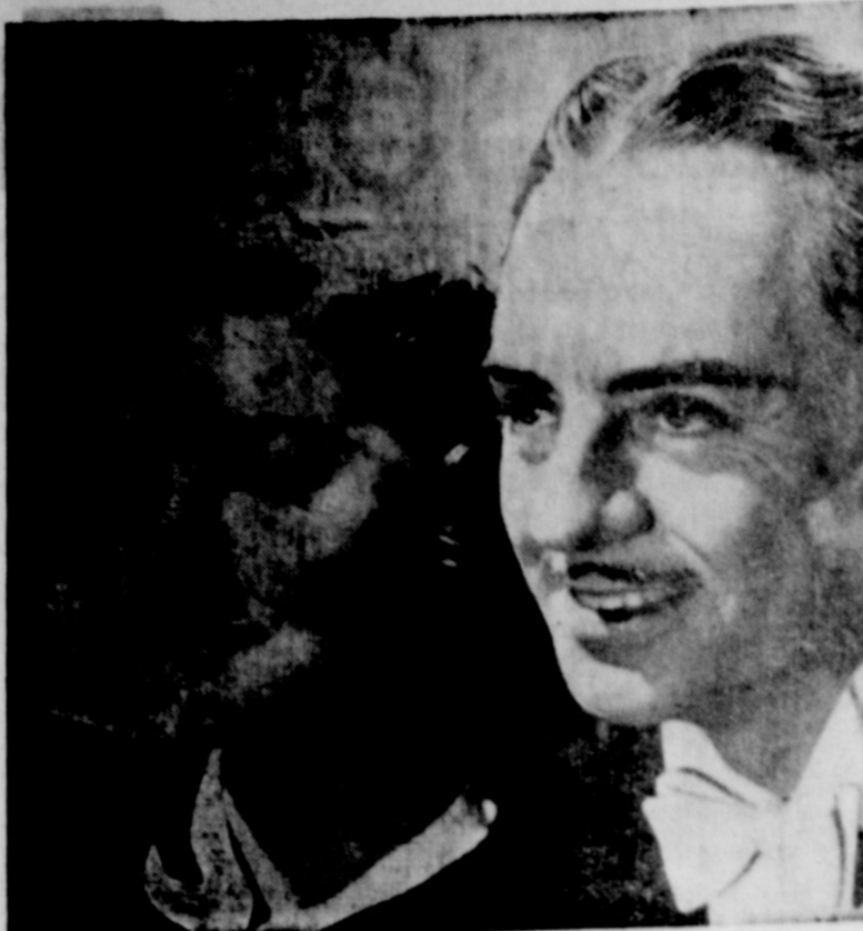
Myrna Loy and William Powell, the screen's favorite "husband and wife," ring up newer and louder laughs in their latest marital comedy, "I Love You Again" playing Monday and Tuesday at the Princess Theatre.