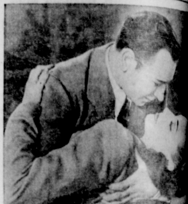
George Raft and Ann Sheridan have eyes only for each other in this scene from "They Drive By Night," coming to the Princess Theatre. Versatile George and lovelier-than-ever Ann, with Ida Lupino and Humphrey Bogart to make the picture the most entertaining of the season.

"They Drive By Night" was adapted for the screen from a novel by A. I. Bezzerides.