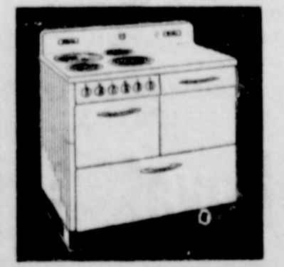
New Hotpoint Century Model only $109.95* installed. Thirty equal monthly payments. Allowance for your old stove.

Cooking that brings you better meals, preserves healthful vitamins, makes your home more modern. Come in today, see our display of new electric ranges and get the facts about today's electric cooking. When you learn how little it costs to cook electrically — how it saves you time, trouble, money — you, too, will join the switch to switches.