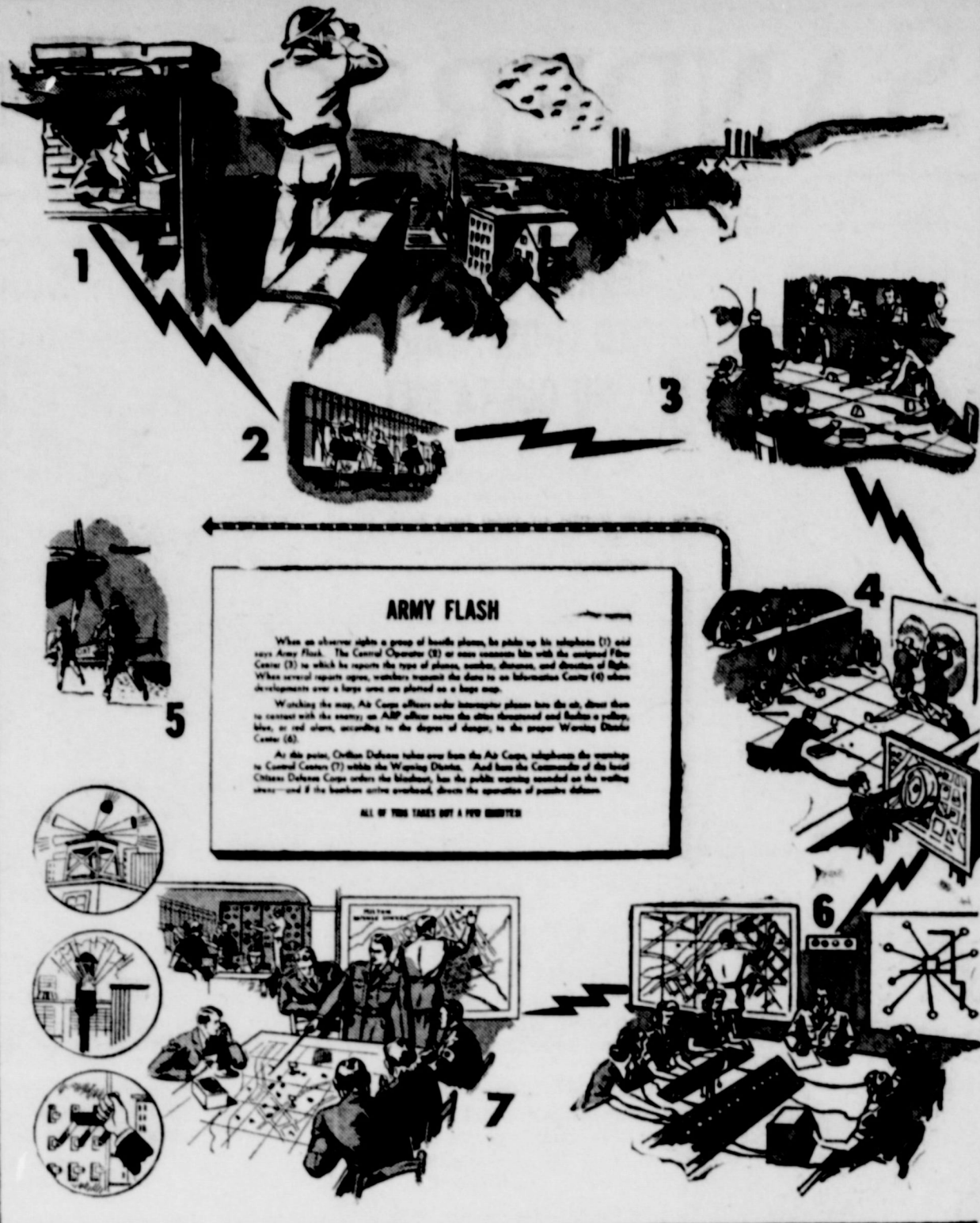
ARMY FLASH When an observer spots a group of hostile planes, he picks up the telephone (1) and calls Army Flash. The Central Observer (2) at once connects him with the nearest Air Center (3) in which he reports the type of planes, number, direction, and distance of flight. When several reports appear, another operator (4) transfers the data to an Information Center (5) where arrangements are made for a large-scale aerial attack. Working the map, Air Center officers order interceptor planes into the air, direct them to intercept with the enemy, or AAF officers order the other Department and Radio or radio, blue, or red status, according to the degree of danger, to the nearest Warning District Center (6). At the same time, Civilian Defense takes over from the Air Center, enlightens the members of Civilian Defense (7) within the Warning District. And from the Commandant of the local Civilian Defense Corps orders the blackout, has the public warning sounded on the warning siren—and if the location is not protected, shows the operation of search lights.