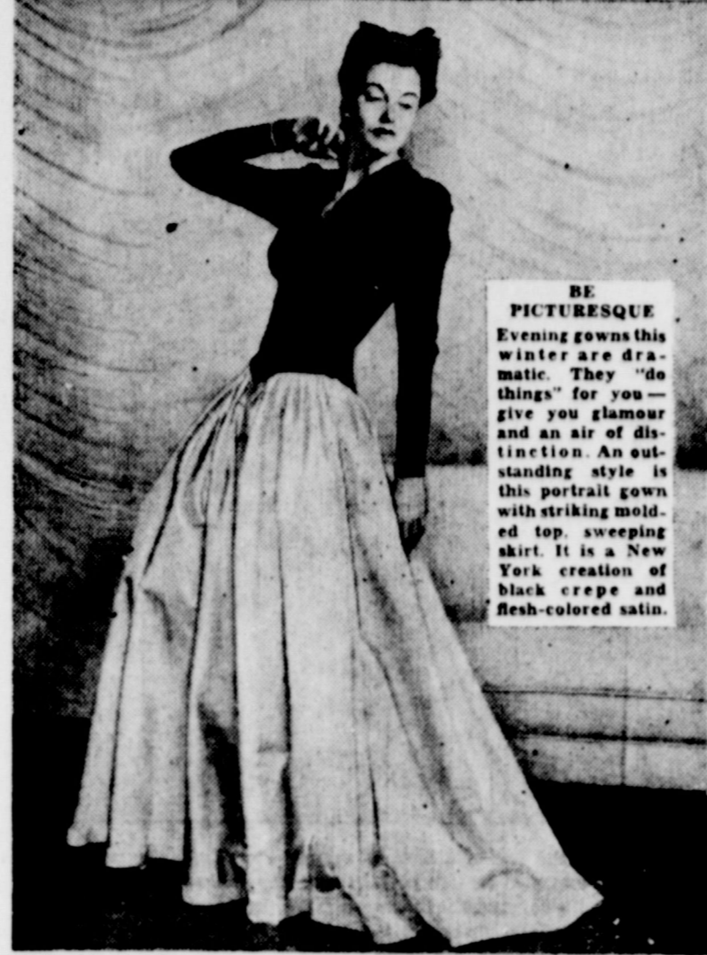
BE PICTURESQUE Evening gowns this winter are dramatic. They "do things" for you—give you glamour and an air of distinction. An outstanding style is this portrait gown with striking molded top, sweeping skirt. It is a New York creation of black crepe and flesh-colored satin.