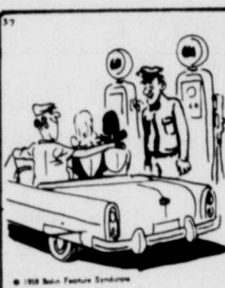
"Is your wife still out of town, Sam?"

You won't have a worry in the world when we service your car!