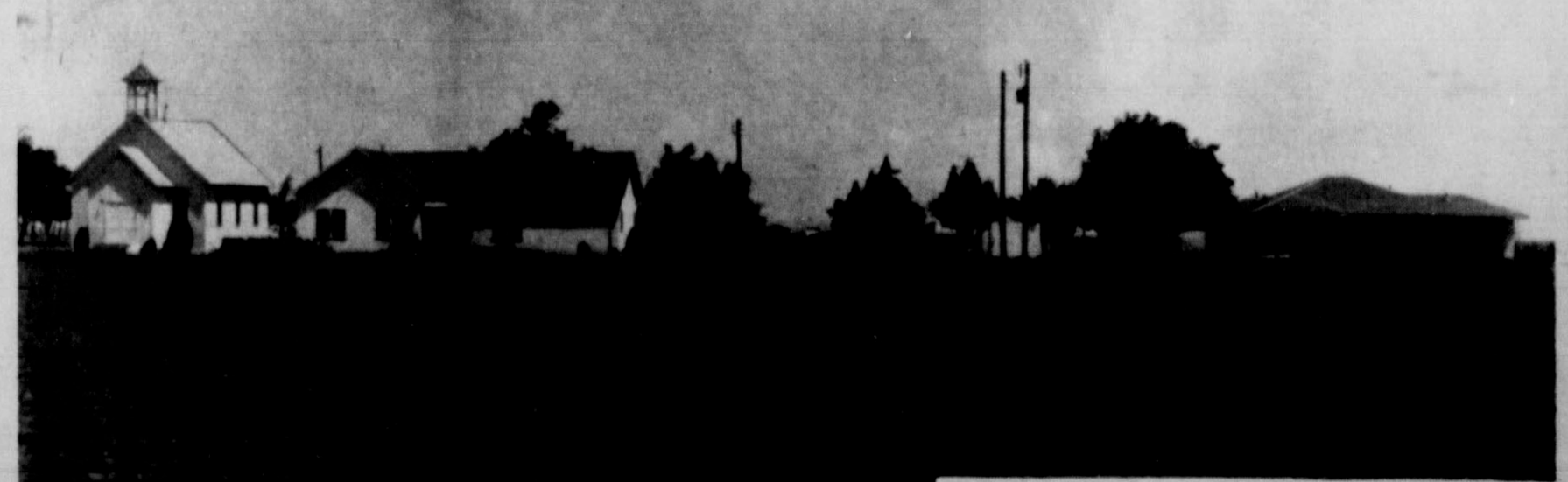
RHEA LUTHERAN CHURCH, 1960 --The sight that greeted many of the visitors at the Rhea Church Sunday was quite different from the first glimpse they had of this same spot of ground in years past. Present church facilities have grown from a colony house and well which first sheltered and provided water, to the plant shown above. Left to right, Church sanctuary, Parish Hall, garage and parsonage. The parsonage was added in 1954.