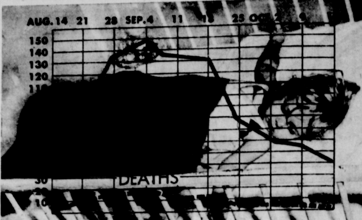
The tragic story of the recent epidemic of infantile paralysis when it hit Chicago is graphically illustrated in this photo of a little victim and the chart showing the rise and fall of polio cases. Much credit for lessening the toll of the epidemic—the third worst in the recorded history of the disease in the United States—goes to The National Foundation for Infantile Paralysis which is supported by the dimes and dollars given by the American people. Many of the 1943's more than 12,000 victims are still patients looking toward the 1944 March of Dimes, January 14-31, for aid.

Processed Foods—Green stamps G, H and J in book four are good through February 29.