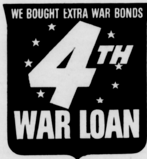
This sticker in your window means you have bought 4th War Loan securities.