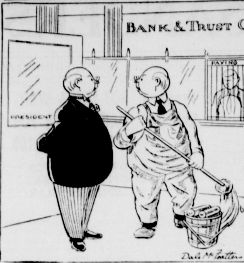
"Er, Parkins, I'm making you head janitor at one of our branch banks!"

institution in the face of a pending $75,000 bond election to build a hospital and after the last bond election straining city finances as far as they felt possible without increasing the tax rate.