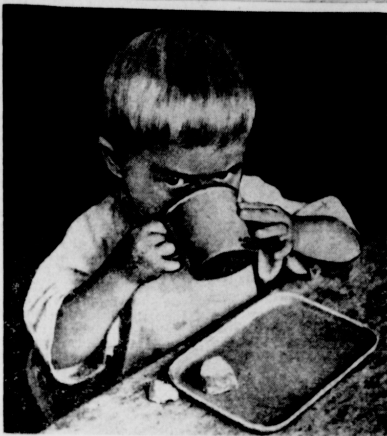
This Czech youngster seems to be afraid someone may take away his weak soup and bread crust. It is his one meal for the day. There are millions of others in Europe and Asia who have not even the meager ration. You can help save them from starvation by giving money or food in tin cans to the Emergency Food Collection.

Similar contracts for agricultural vocational schools are operating in Louisiana and Mississippi.