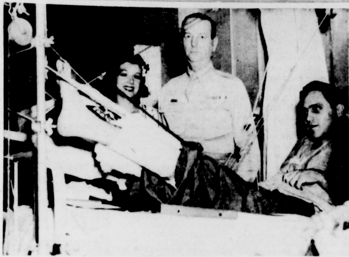
SAN ANTONIO, TEXAS (Special)—General Jonathan M. Wainwright, Fourth Army Commander and Army advisor for the Texas USO Campaign, visits a USO Show ward performance on his tour of Brooks General Hospital at San Antonio, Texas.

DON'T FORGET! The boys in overseas service Give to the U. S. O.