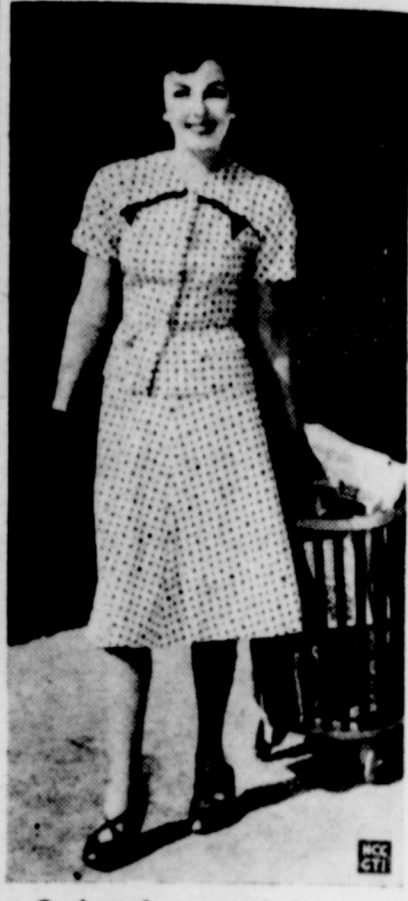
Cool and practical for warm weather wear is this pale blue cotton two-piece worn by Frances Gifford, M.G.M. player. The dress, which looks like a suit, is good for marketing in the village, equally good in the city. It is printed with a cross and ball design in black, has a black insert on the yoke of the jacket.