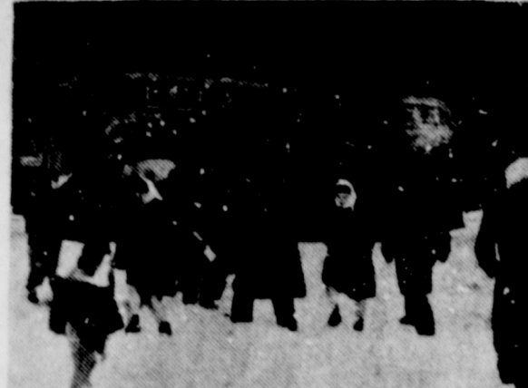
PLOW THROUGH DEEP SNOW IN NEW YORK—New Yorkers, en route to work recently, had to plow through 11-inch deep snow. Scene is at 5th Ave. and 42nd St., N.Y.C., during the heaviest snowfall of the year.