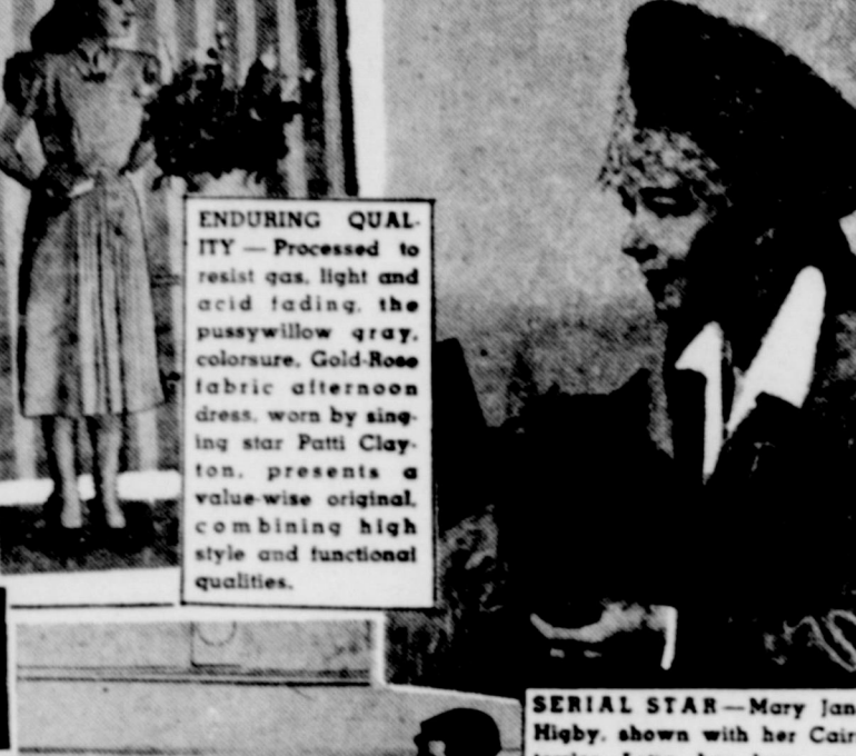
ENDURING QUALITY—Processed to resist gas, light and acid fading, the pussywillow gray, colorure, Gold-Rose fabric afternoon dress, worn by singing star Patti Clayton, presents a value-wise original, combining high style and functional qualities.