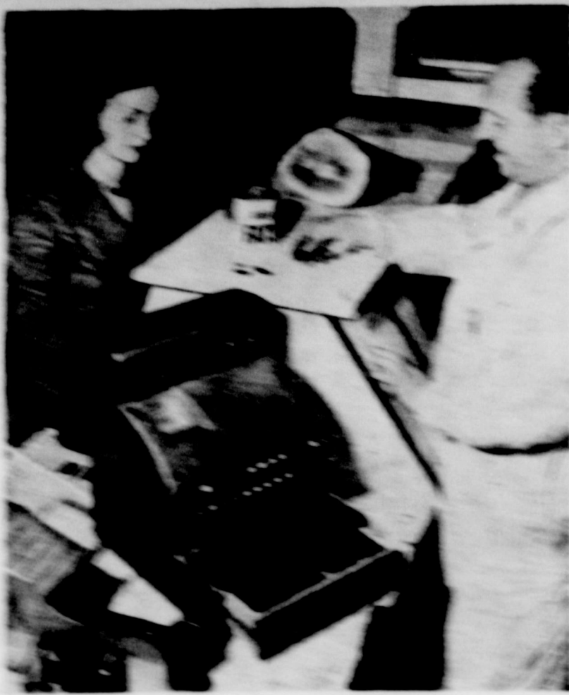
Students and officials gathered around a table during a ceremony.

The meet, which will be held in Austin, Texas, will be held in May 15-17 at the University of Texas at Austin.