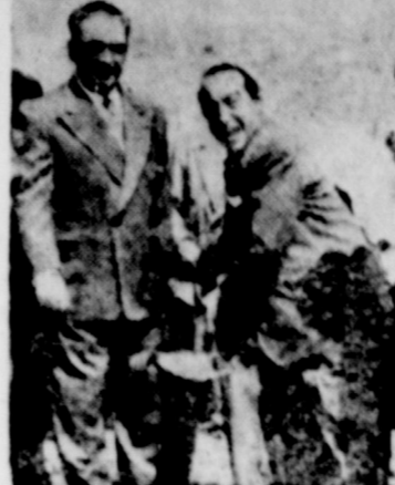
DIG FOR PEACE — First shovel of ground broken for new United Nations headquarters in New York City is held by Benjamin Cohen, acting secretary of UN, with Mayor William O'Dwyer looking on. Headquarters buildings will cost $65,000,000.00.