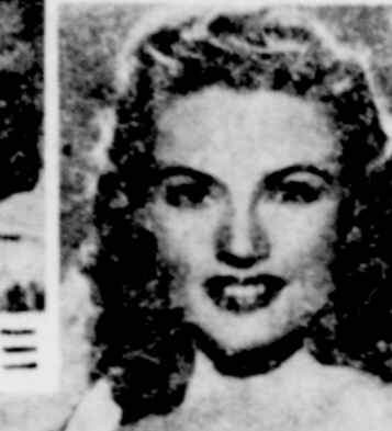
NEW BEAUTY — Gale Robbins above, is newest of luscious beauties to grace the screen.