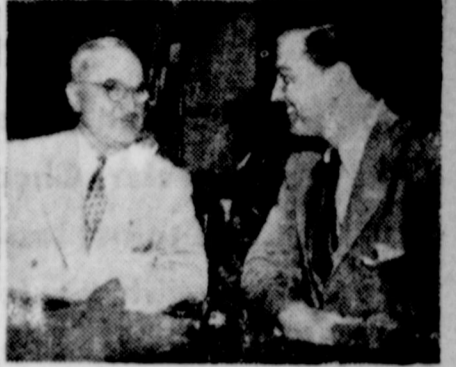
ROOSEVELT AND TRUMAN —Franklin D. Roosevelt, Jr. (right) visits President Truman at White House offices after he was sworn in as a member of the House, representing New York City's 20th district.