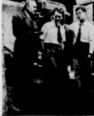
"SILVER" CONFERENCE —Seen in conference for the new Monday night "Silver Theater" television series, sponsored by International Silver Company, premiering on CBS-TV in October, are (L. to R.) host Conrad Nagel; Burgess Meredith, guest star on the opening telecast; and director Frank K. Telford.