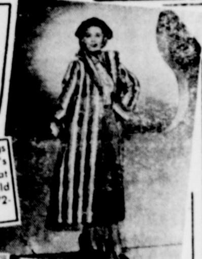
ATTRACTIVE TOP COAT worn by Joan Caulfield in "Dear Wife", of grey and white striped wool. Full lar worn either up or down.