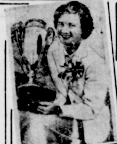
VICTORY SMILE —Louise Suggs poses after winning the Women's National Open Golf Tourney at Landover, Md. The 25-year-old Carrollton, Ga., girl fired a 72-hole total of 291 to win.