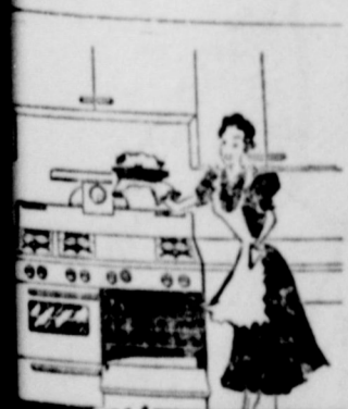
WOMEN MEMO BY JEAN CLARKE

Recreation services and recreational activities are big steps toward "normal life." But Rusk State Hospital is the only institution with a suitable building for recreation and play, and it is crowded.