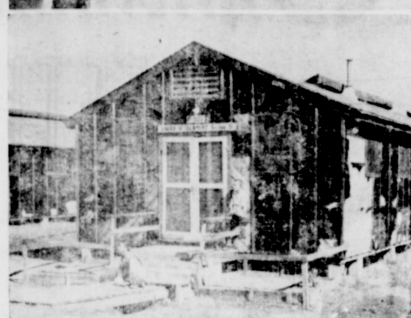
CROWDED AND FALLING APART are many of the buildings at the Mexia State School, shown above, which houses the young feeble-minded of the State and senile men and women. The picture above shows a group of patients crowded on a porch (an attendant is in the foreground) because they have no other place to sit. Below, is one of the old tar-paper shacks at Mexia, which in 1943 was used to house war prisoners. The photo shows how it is falling apart at the seams, yet it is still being used to house mentally deficient children.

Representatives of the hospitals will be explaining the economics of "room and board" for mental patients who have been returned to so-called "state boarders."