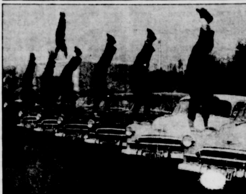
Seven members of the Danish Gym Team, a group of 36 boy and girl amateur athletes, perform in unison a difficult handstand on Chevrolets being used on a 20,000-mile, 11-month motor tour of the United States. Members, carefully selected by competitive tests in their native Denmark, appear under the auspices of churches, colleges and YMCAs.