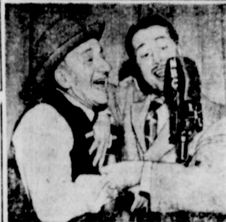
JIMMY AND DON RETURN —Jimmy Durante, the Wizard of Schnoz, genially fights his way back to the microphone as his partner-in-laugh Don Ameche tries to squeeze in the first joke. "The Nose" returns to radio following a summer vacation, on Friday, Oct. 7, over NBC at 9:30 p.m. E.S.T.