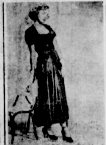
TAFFETA POPULAR —Diana Lynn, to be seen in "My Friend Irma," wears this polka dot dress of dark green and bronze changeable taffeta. It has a square neckline with flanged collar and cuffs.