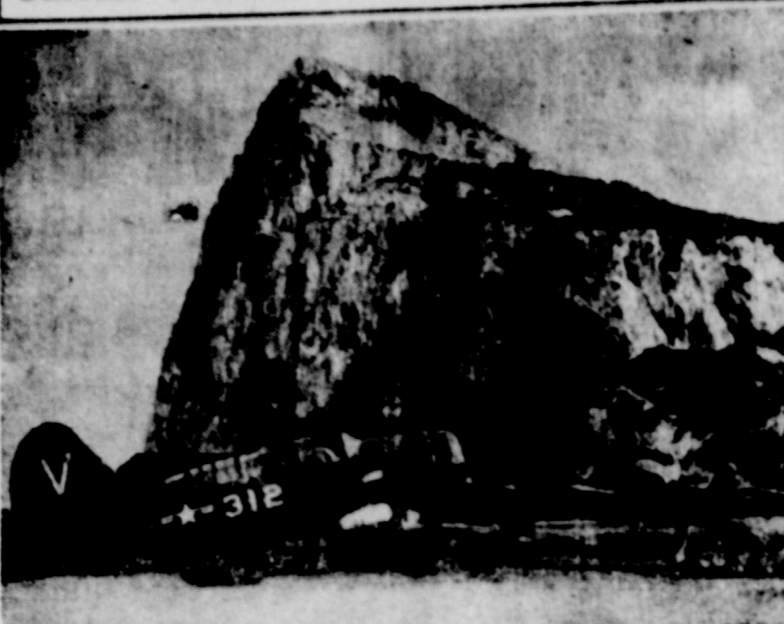
The promontory of the historic fortress of Gibraltar serves as a backdrop for planes of the U. S. Navy's Valley Forge during the carrier's visit to the famous British bastion of the Mediterranean. The planes were land-based at the Royal Air Force strip during the ship's stay in Gibraltar.