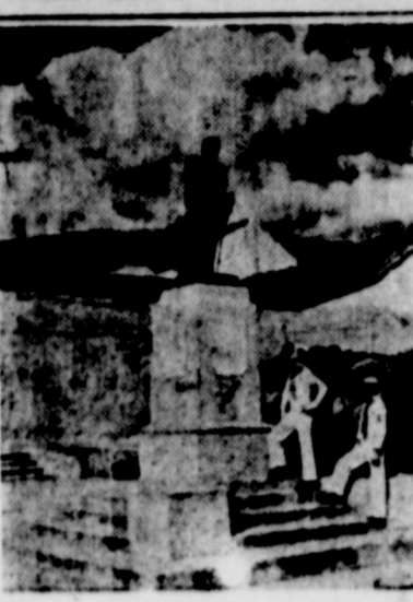
Two U. S. Navy men spend part of their time ashore in Caracas, Venezuela, to view one of the many statues in that city reared to national heroes and to pay their respects to the memory of the military leader represented in bronze above them.