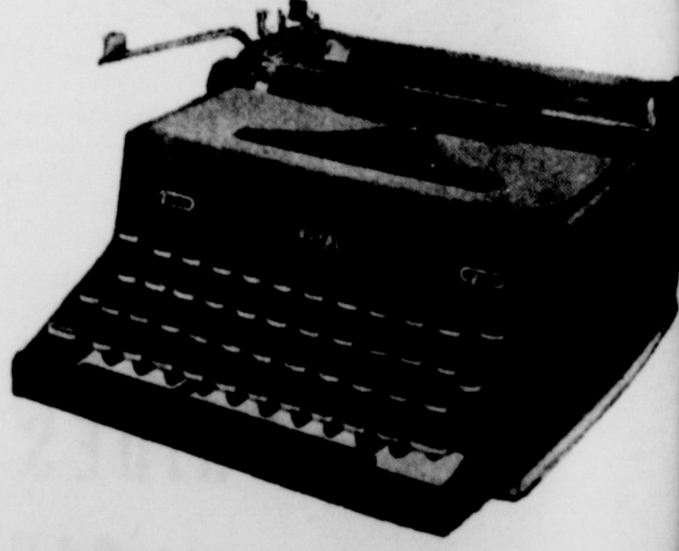
ROYAL Portable Typewriter