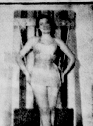
A BRIGHT NEW STAR —Nancy Olson, Paramount's new find, gets star billing in "Mr. Music" with Bing Crosby. She will soon be seen in "Sunset Boulevard."