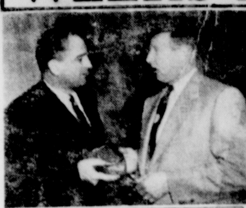
RECEIVES AWARD —Sen. J. R. McCarthy (left), a World War II Marine Corps veteran, receives the Marine Corps League's national American award for 1950 for "rousing the nation to the menace of bad security risks in our government."