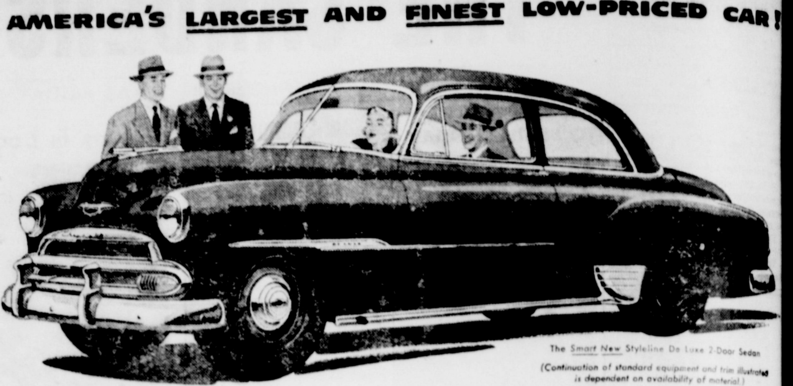
The Smart New Styleline De Luxe 2-Door Sedan (Continuation of standard equipment and trim illustrated is dependent on availability of material.)

Refreshingly new IN ALL THE THINGS YOU WANT