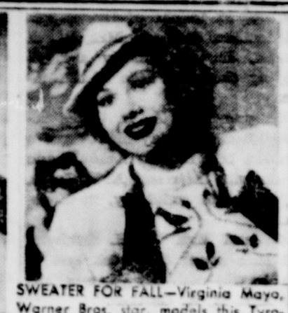
Warner Bros. star, models this Tyralean hat and jacket of white Lader fabric with bright red and green trim. -10-SCHOOL AID-For kids going It is hand-knitted and designed by