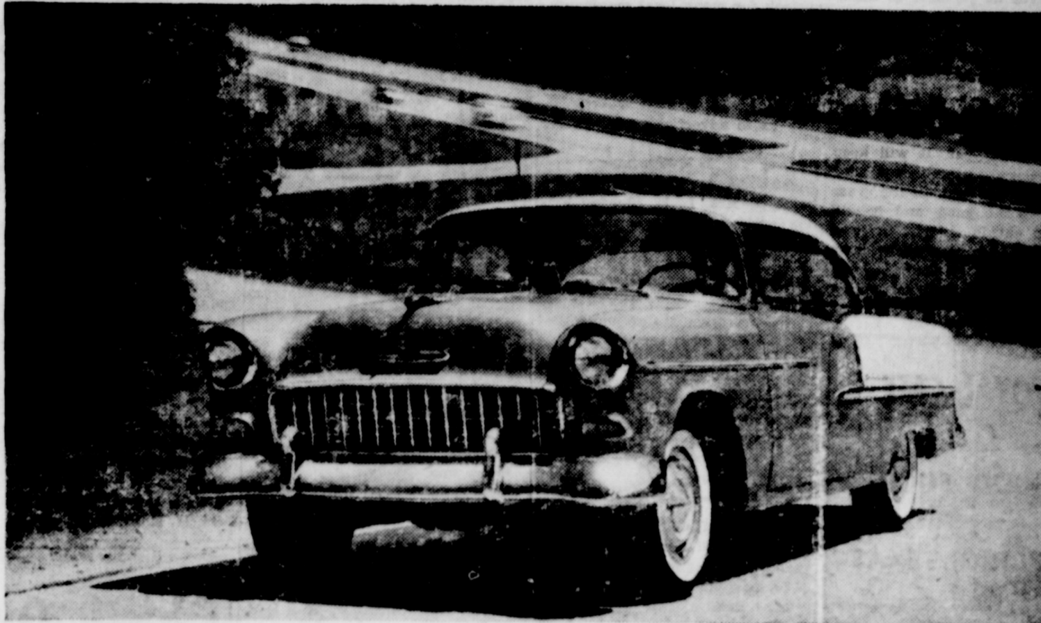
Great Features back up Chevrolet Performance: Body by Fisher—Ball-Race Steering—Outrigger Rear Springs—Anti-Dive Braking—12-Volt Electrical System—Nine Engine-Drive Choices.

The new Chevrolet has proved itself all K-I-N-G in today's toughest driving competition!