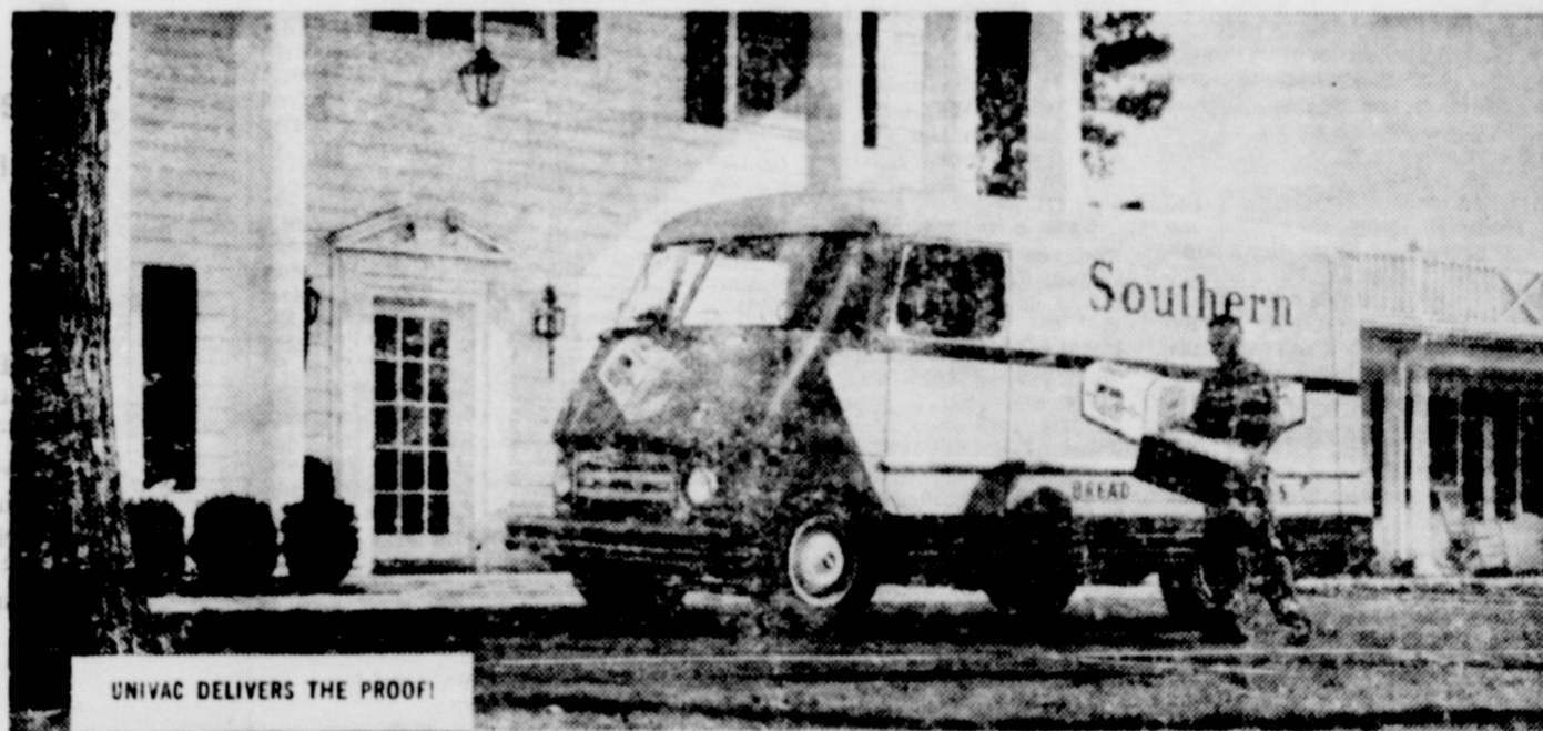
UNIVAC DELIVERS THE PROOF!