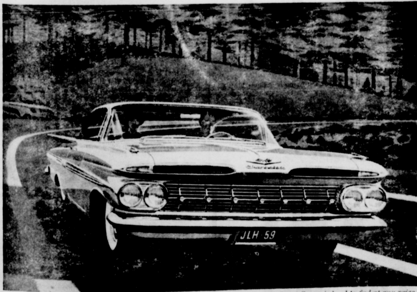
More car than this Impala Sport Coupe is hard to find at any price.

clings to curves like a cat on a carpet! the travel-lovin' Chevrolet